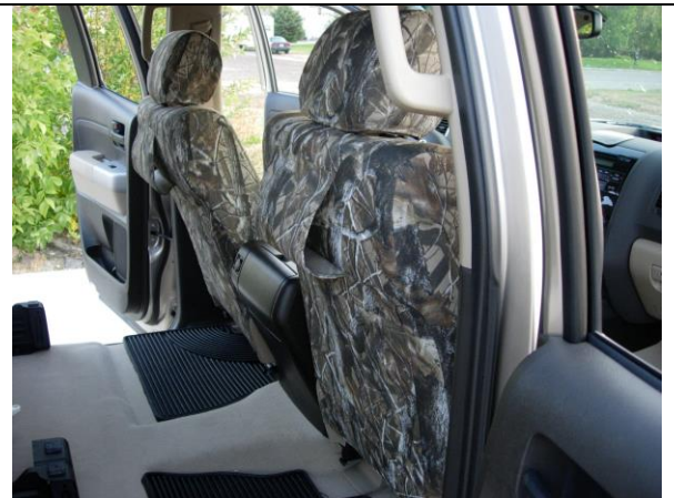
Seat covers that hold a gun, maps, or anything else you want to store, you are all set for the outdoors.