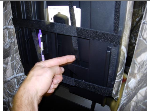
Step 26. Lid/L: Connect it to the front Velcro™ where shown.