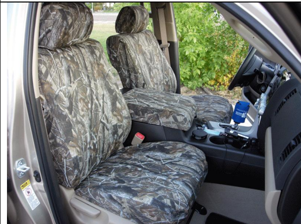
Congratulations, you're done. It does take a little effort to get them on, but once they're in place they will give you several years of use.