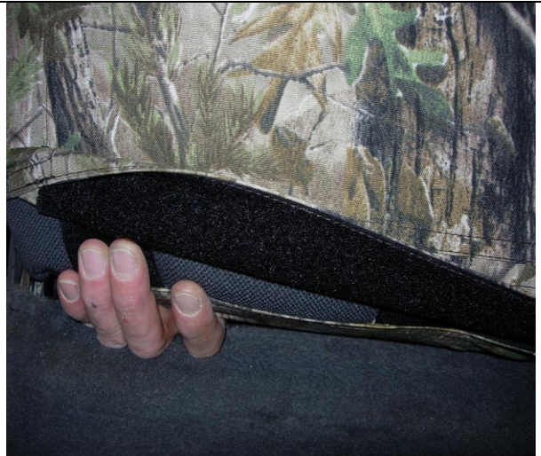
28. Driver & Passenger Top/DT&PT: Once the seat cover is pulled down into position, push the hook Velcro™ through to the back. Then, using one hand in a smoothing action down the front of the seat cover from top to bottom, gently pull on the Velcro™ from behind with the other hand, tightening the seat cover. Then follow the Velcro™ through to the back with the front hand, pinning it tightly to the seat, then connect it to the back loop Velcro™. Work from one side to the other. A few attempts may be needed to get it just right.