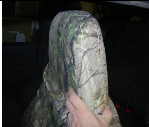
27. Driver & Passenger Top/DT&PT: Form the top of the seat cover to the integral headrests, then form the seat cover around the shoulders of the seat by pulling down on front and back, lining up the seams, straightening if necessary.