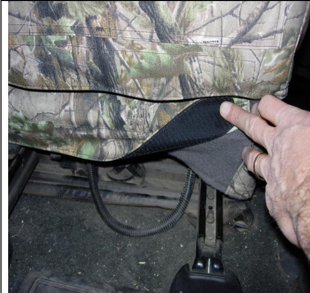
25. Passenger Bottom/PB: As in step 21, connect the rear most part of the seat cover to the carpet fuzz on the back edge.