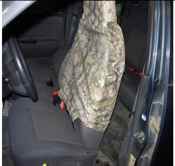
26. Driver & Passenger Top/DT&PT: Slide the seat cover on partway with the extending hook Velcro™ to the front. Note how tight it goes on.