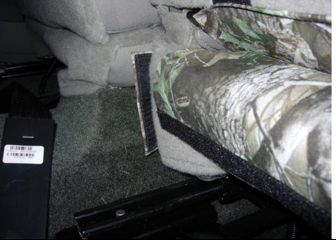
Step 4. Driver and Passenger bottom/DB&PB: View from behind the passenger seat. Line up the seat cover seams with the seams on the seat, they should closely match. Pull the inside flap of seat cover behind the seat belt back and press the Velcro<sup>™</sup> to the carpet on the seat. Tuck the rear part of the seat cover into the seat, pull it down to the bottom edge and connect it to the carpet on the seat.