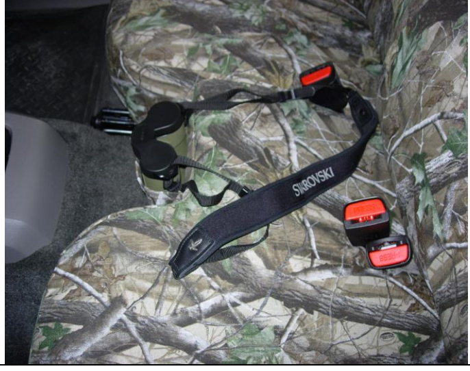
With all the necessary accessories, you are ready to go outside and play.