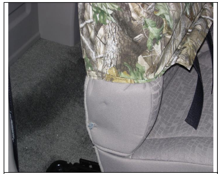
Step 1. Driver & Passenger tops/DT&PT: Temporarily remove the side lever attached to the backrest with a Torx #15.

All the parts of the seat cover are labeled inside. Use the seat cover piece identification chart to ID parts.