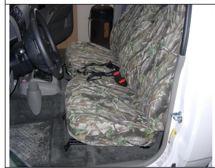
2007 Colorado Regular Cab pictured in Realtree Hardwoods Green HD.