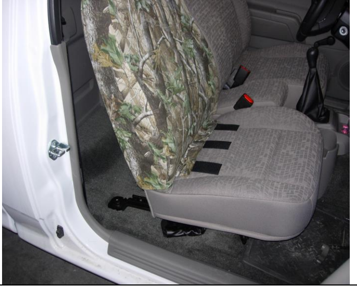
Step 2. Driver & Passenger tops/DT&PT: Position the cover so the seams of the seat cover closely line up with the seams of the seat. Tuck the hook Velcro<sup>™</sup> into the seat and mate the hook to the loop Velcro<sup>™</sup> sewn inside the back edge. Be careful to not over tighten the hook Velcro<sup>™</sup> because they permanently dent your seat.