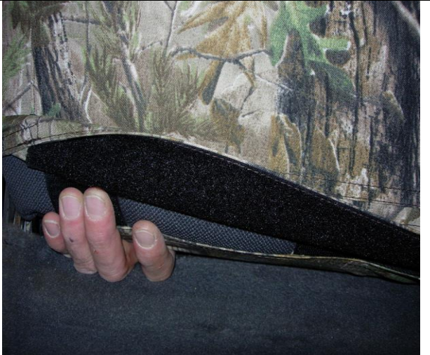
28. Driver & Passenger Top/DT&PT:

Form the top of the seat cover to the integral headrests, then form the seat cover around the shoulders of the seat by pulling down on front and back, lining up the seams, straightening if necessary.