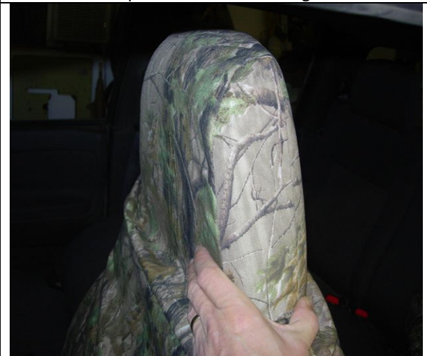
27. Driver & Passenger Top/DT&PT:

Form the top of the seat cover to the integral headrests, then form the seat cover around the shoulders of the seat by pulling down on front and back, lining up the seams, straightening if necessary.