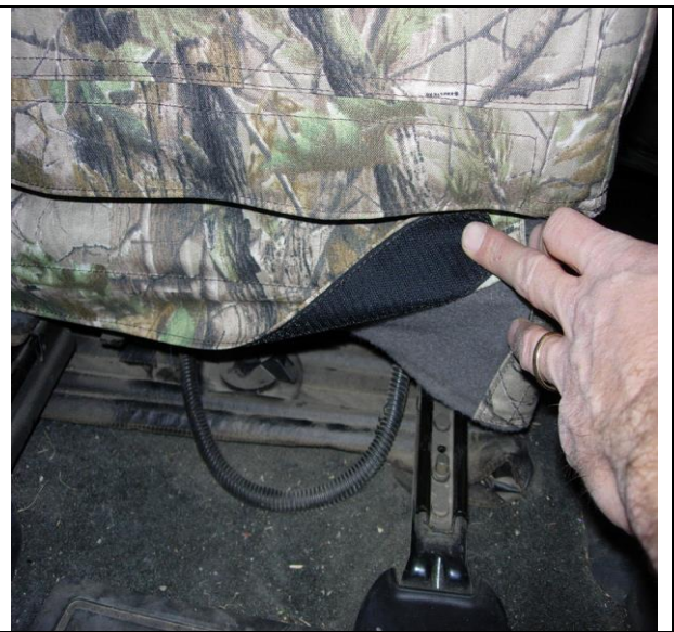
25. Passenger Bottom/PB:

As in step 21, connect the rear most part of the seat cover to the carpet fuzz on the back edge.