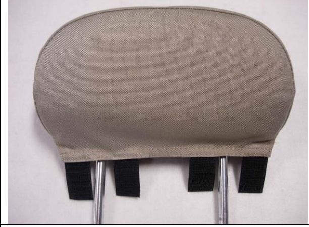
Step 2. Headrests/H:

Temporarily remove the headrests by lifting up the seat bottoms, the lift the headrest up all the way. Use gentle upward pressure on the headrest, insert a small Allen wrench into the holes in the plastic until it releases.