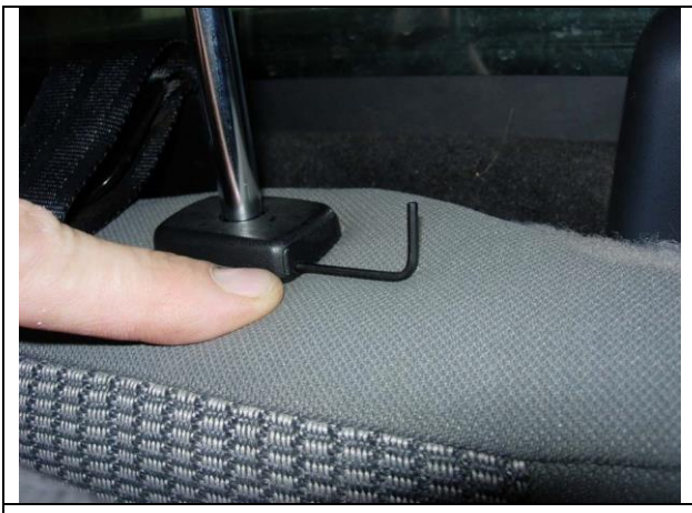
Step 1. Driver & Passenger Seat:

Temporarily remove the headrests by lifting up the seat bottoms, the lift the headrest up all the way. Use gentle upward pressure on the headrest, insert a small Allen wrench into the holes in the plastic until it releases.