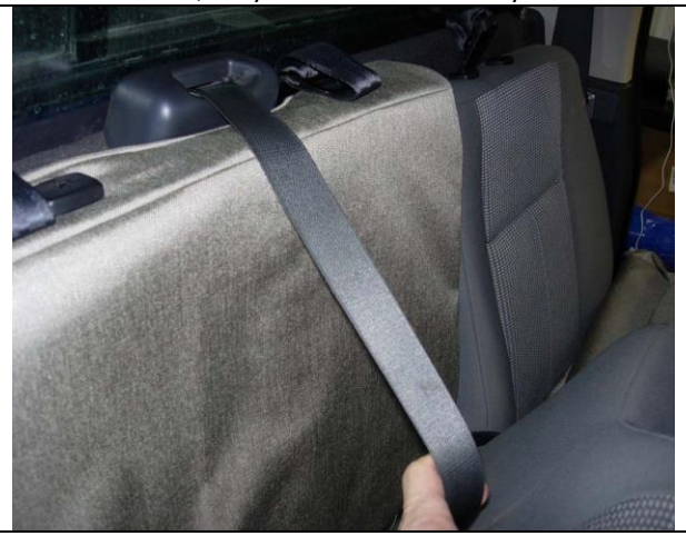
Step 4. Driver & Passenger Top/DT&PT:

Connect the Velcro \mbox{^{TM}} as shown under the back edge.