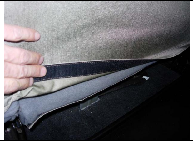
Step 12. Driver & Passenger Bottom/DB&PB: Lastly, pull the bottom edge down and press it to the carpet fuzz on the underside of the seat.