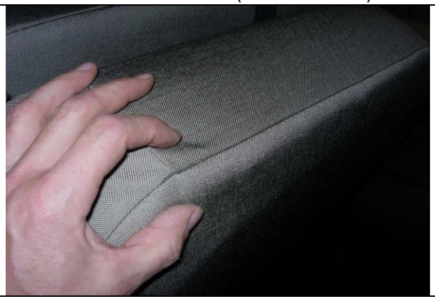
Step 10. Driver & Passenger Bottom/DB&PB: Lift the seat bottoms up. Slide the covers on with the lettering inside the covers "DB & PB" to the top. Form the seat covers to the seat, again lining up the seams of the seat cover to the seams of the seat, they should match closely. Work the seat cover fabric on the inside from thumb to forefinger around the corners.