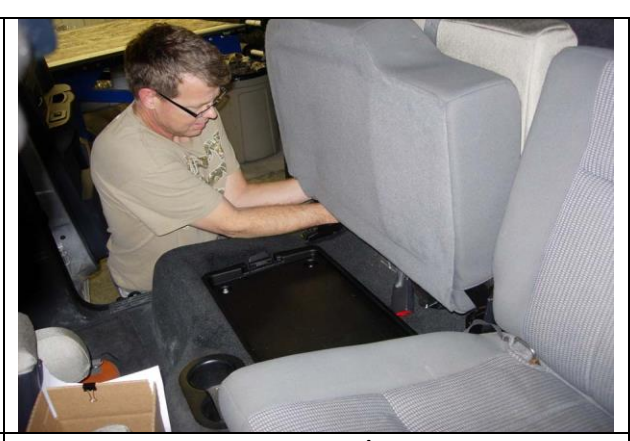
Step 8. Driver & Passenger Top/DT&PT: While kneeling outside the truck, use one hand to reach under the seat and feed the front Velcro™ around to the side of the seat and press it to the side of seat with the outside hand (left hand shown).