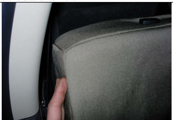
Step 6. Driver & Passenger Top/DT&PT:

Tuck the seat cover under the plastic for the headrests.