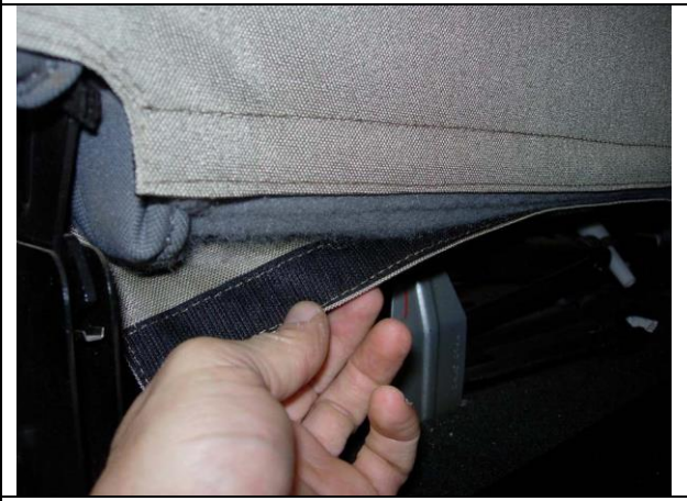
Step 11. Driver & Passenger Bottom/DB&PB: Pull the back edge down and press it to the caret fuzz as shown.