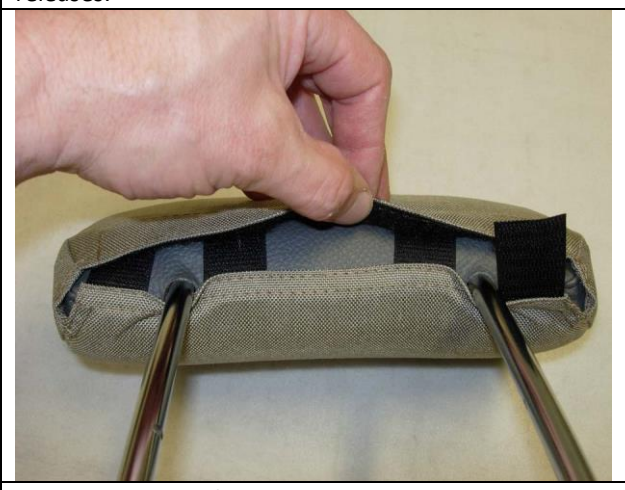
Step 3. Headrests/H:

All the parts of the seat cover are labeled inside. Use the Seat Cover Part ID Chart to identify parts. Slide the cover on with the extending hook Velcro™ to the front. Line up the seams of the cover to the seams of the headrest, they should match closely.