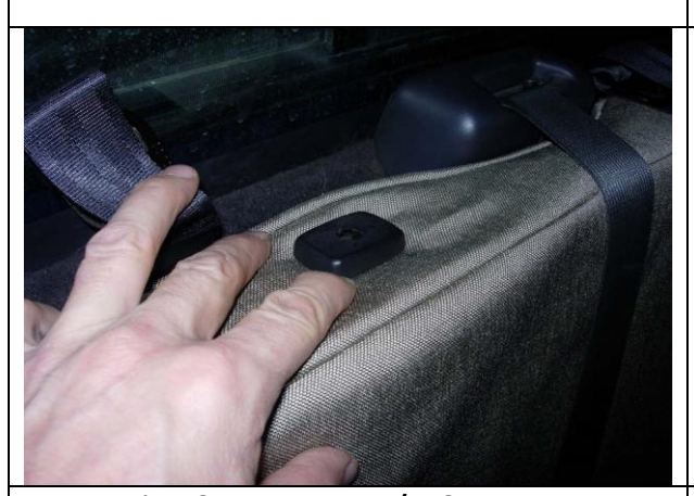
Step 5. Driver & Passenger Top/DT&PT:

Driver side, pull the seat belt away from the seat and tuck the cover behind it.