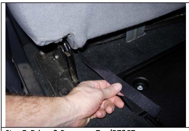
Step 7. Driver & Passenger Top/DT&PT: Tuck the bottom corners of the seat cover around the front of the seat. Locate the long side hook Velcro™