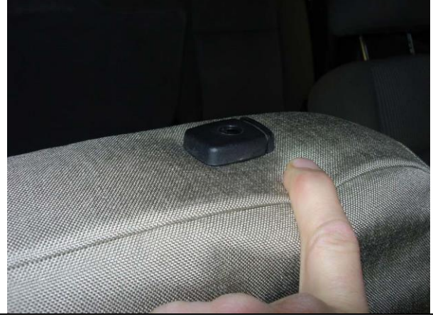
Step 7. Driver & Passenger Top/DT&PT: Tuck the fabric under the plastic for the headrests starting with the push button side first.