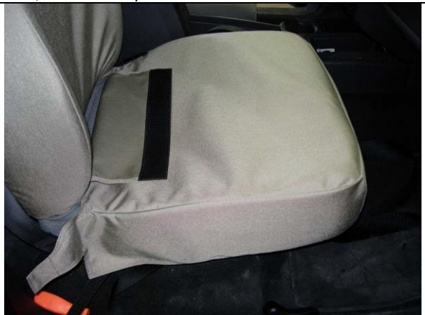
Step 10. Driver & Passenger Bottom/DB&PB: Slide the seat cover bottom on as shown. Tuck in the back edge and pull the cover back into position. Again, same as Step 2 & 8, line up the seams of the seat cover to the seams of the seat, they should match closely.