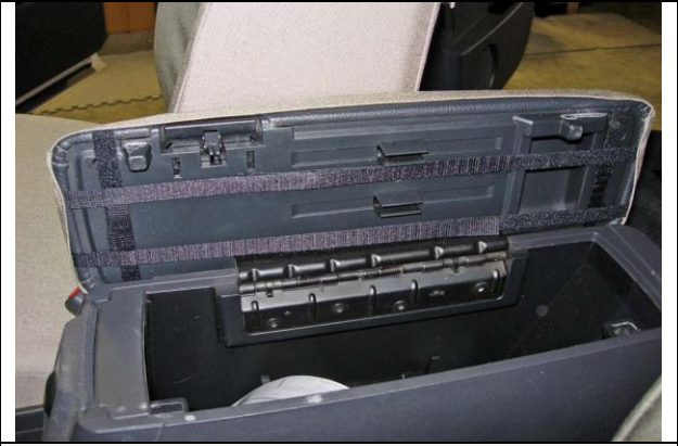
Step 16. Console Lid/L: Connect the Velcro<sup>™</sup> under the lid as shown.

Step 15. Driver & Passenger Bottom/DB&PB: Fold the long front hook Velcro in half lengthwise to stiffen it up. Route them to the back edge and connect them to the carpet on the back edge. Lastly, pull the back edge of the seat cover back and press the hook Velcro<sup>™</sup> to the carpet fuzz.