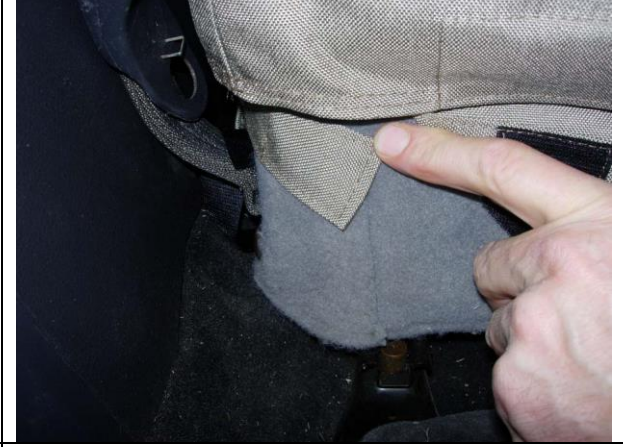
Step 12. Driver & Passenger Bottom/DB&PB: Pull the inside around to the back and press the hook Velcro<sup>™</sup> to the carpet as shown.

Step 11. Driver & Passenger Bottom/DB&PB: Pull the outside edge of the seat cover around to the back and press the hook Velcro<sup>™</sup> to the carpet on the back edge of the seat, making sure to line up the hole for the recline lever.