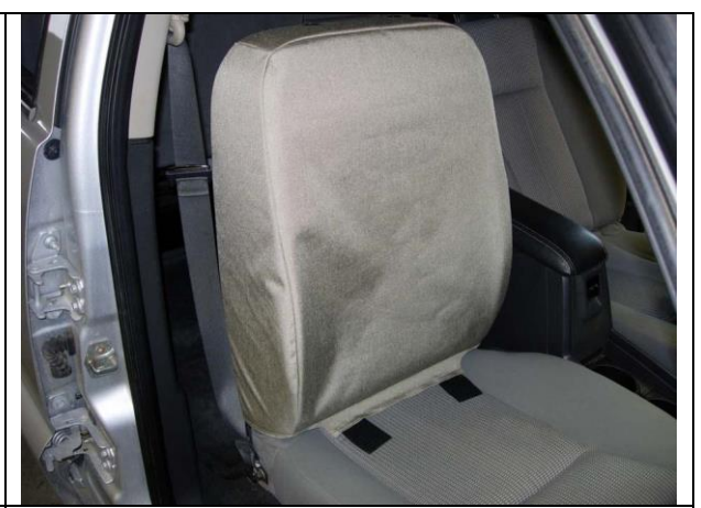
Step 6. Driver & Passenger Top/DT&PT: Slide the seat cover on with the extending hook Velcro<sup>™</sup> to the front as shown.