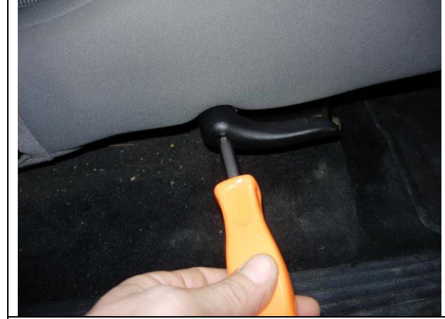
Step 5. Driver & Passenger seats: Using a Phillips screwdriver and remove the recline lever and set it aside.