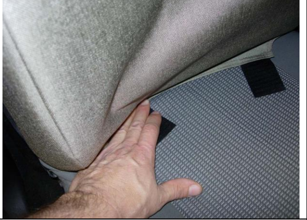
Step 8. Driver & Passenger Top/DT&PT: Tuck the extending hook Velcro<sup>™</sup> into the seat. Again, line up the seams of the seat cover to the seams of the seat, same as Step 2.

Step 9. Driver & Passenger Top/DT&PT: Gently pull on the Velcro<sup>™</sup> from behind the seat with one hand while using the other hand to smooth the seat cover from top to bottom. The use the front hand to pin the Velcro<sup>™</sup> to the seat, then press the Velcro<sup>™</sup> together.