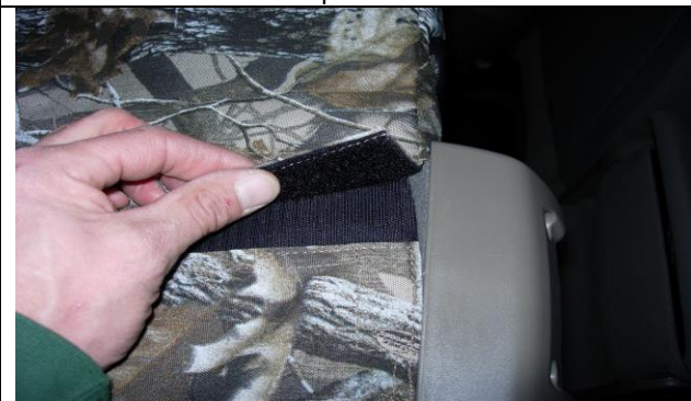
Step 13. Passenger Top/PT: Starting at the top, connect the Velcro™ below the seatbelt.