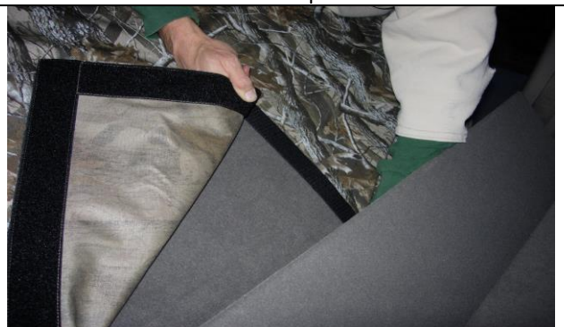
Step 14. Passenger Top/PT: Connect the Velcro™ using slight downward pressure, all the way to the bottom.