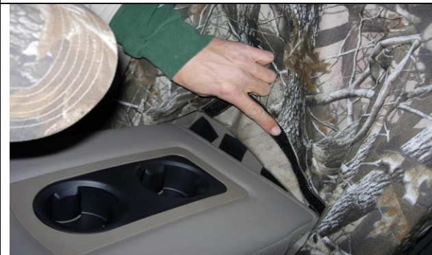
Step 9. Passenger Top/PT: Align and connect the Velcro™ behind the armrest.