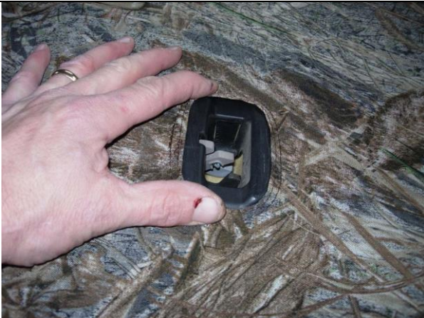
Step 9. Driver and Passenger Top/DT&PT: Be sure to line up the opening for the latch.