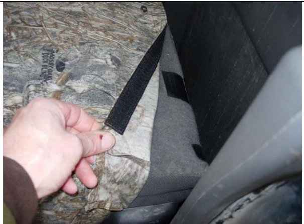
Step 10. Driver and Passenger Top/DT&PT: Starting on the inside edge, press the Hook Velcro™ onto the carpet on the seat. Then, flip the seat up and see if the cover needs to be adjusted or Velcro™ tightened for best fit.