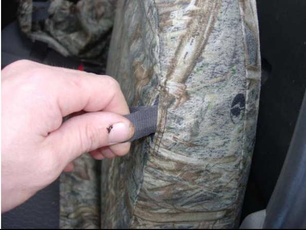
Step 5. Driver and Passenger Top/DT&PT: Feel inside the opening on the seat cover for the release strap and pull it through.