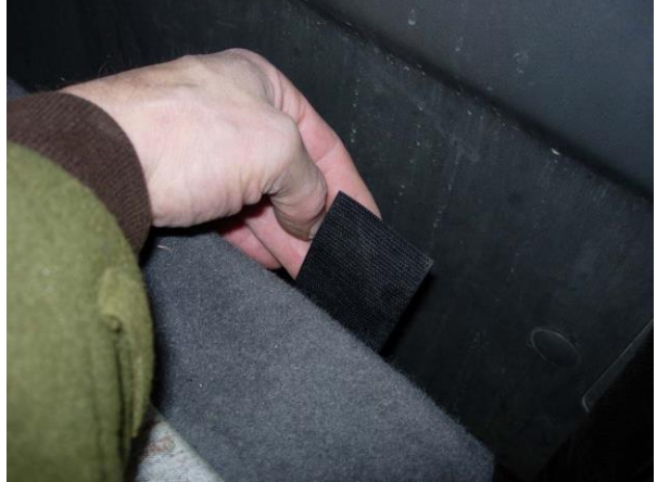
Step 8. Driver and Passenger Top/DT&PT: Pull the Hook Velcro™ tight and press it to the carpet on the back edge of the seat.