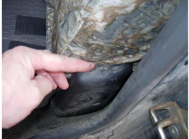
Step 6. Driver and Passenger Top/DT&PT: Pull down the left and right side of the covers and tuck the cover behind the plastic on the outside edge.