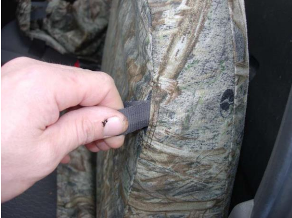
Step 5. Driver and Passenger Top/DT&PT: Feel inside the opening on the seat cover for the release strap and pull it through.