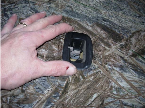
Step 9. Driver and Passenger Top/DT&PT: Be sure to line up the opening for the latch.