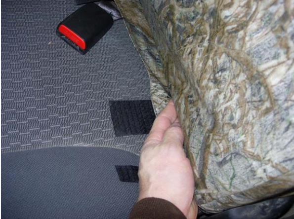
Step 7. Driver and Passenger Top/DT&PT: Tuck the Hook Velcro™ into the seat and fold the seat down