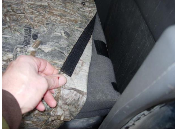
Step 10. Driver and Passenger Top/DT&PT: Starting on the inside edge, press the Hook Velcro™ onto the carpet on the seat. Then, flip the seat up and see if the cover needs to be adjusted or Velcro™ tightened for best fit.