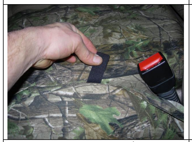
Step 11. Driver & Passenger Bottoms/DB&PB: Tuck the long inside edge hook Velcro™ down next to the middle bottom and route it through the gap between the seat and seat slide and press it to the carpet on the back edge. If it sticks to carpet on the inside edge of the seat, pull it back up and cut the Velcro™ down to 4″ and press it to the carpet on the side of the seat.