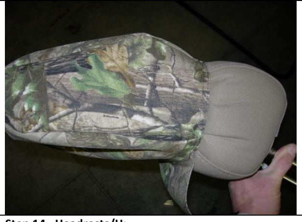
Step 14. Headrests/H: Slide the cover on with the headrest still on the seat and the hook Velcro™ to the front. You will have to compress the headrest to get it on. The headrest will relax once pulled all the way down.