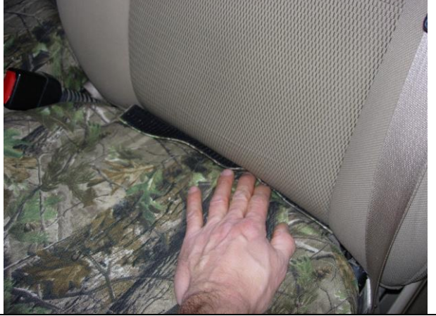
Step 12. Driver & Passenger Bottoms/DB&PB: Tuck the back edge of the seat cover into the seat.