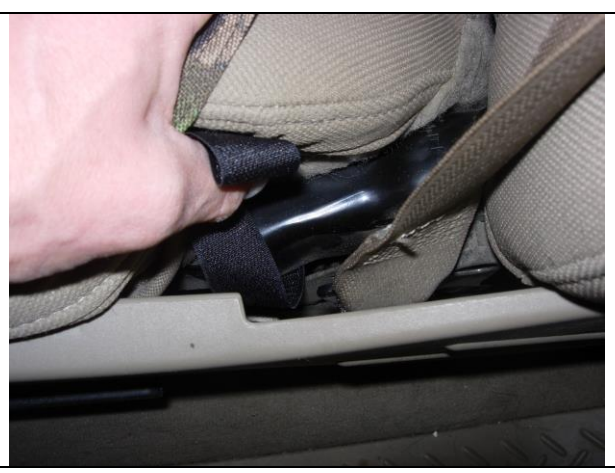
Step 10.Driver & Passenger Bottoms/DB&PB: View from the outside edge of the driver's seat bottom. Push the fabric and foam of the seat in and slide the long outside edge hook Velcro™ into the gap in the metal (above the shiny metal shown in the picture). Fold the Velcro™ in half lengthwise again. Carefully feel under the back of the seat for the Velcro™. You will find it below the spring in a gap in the metal. You can use a screwdriver or pencil to fish it out of the gap. This will be the most difficult part of the installation and will take a few tries. Once pulled through pull tight and press the Velcro™ to the carpet on the back of the seat.