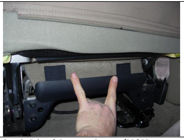
Step 9. Driver & Passenger Bottoms/DB&PB: Route the long hook Velcro™ under the seat by folding it in half lengthwise with the sticky inwards. This will stiffen the Velcro™ and make it easier to route under the seat. Avoid any seat mechanisms, in front of the metal bar, pressing them to the carpet on the back edge of the seat where shown.