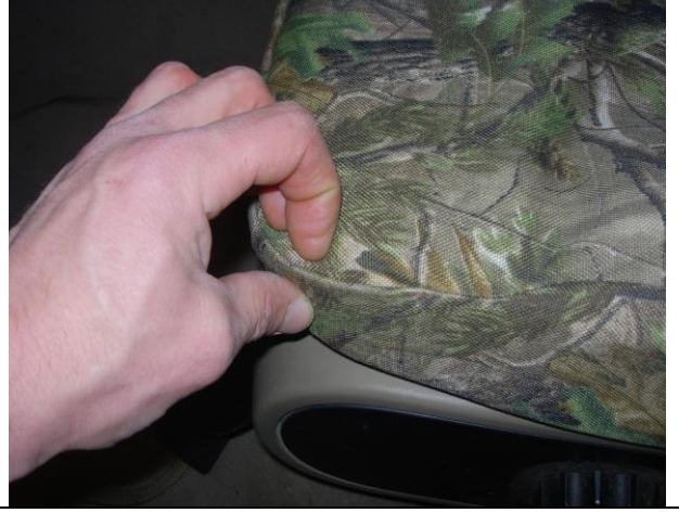
Step 8. Driver & Passenger Bottoms/DB&PB: Place the seat cover on with the long hook (sticky) Velcro™ to the front. Again, the seams of the seat cover should closely match the seams of your seat. Work the fabric inside the seat cover around the front of the seat cover out from forefinger to thumb until you get to the dip in the seat (4" to the right of the hand). Work the material from the dip to the back in the opposite direction towards the middle of the seat.