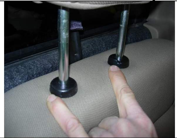
Step 1. Driver and Passenger Tops/DT&PT:

2004-2008 F-150 Super <u>Cab Bucket Seat Installation</u>