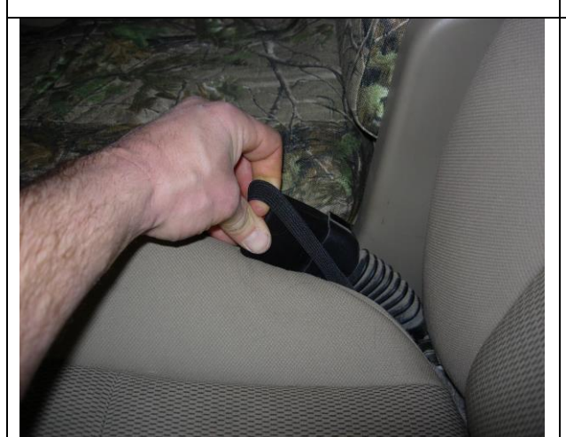
Step 7. Driver & Passenger Bottoms/DB&PB: View from the driver's side next to the console. Remove the seatbelt from its elastic restraint. The seatbelt will stay up without the help of the elastic.