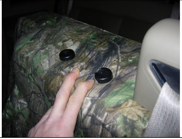
Step 2. Driver and Passenger Tops/DT&PT:

Remove the headrests by lifting them up all the way using the push button release on the right side. Next, use gentle upward pressure and depress the semihidden push button release on the left.