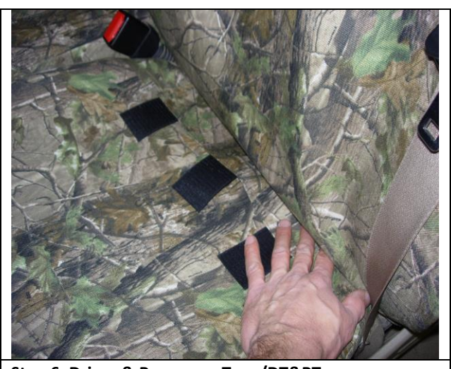
Step 6. Driver & Passenger Tops/DT&PT: Pull the bottom inside edge (next to the console) and the outside edge down, lining up the seams. Tuck the hook Velcro™ into the seat and connect them to the loop Velcro™ sewn inside the back edge. Do this by gently pulling on the Velcro™ from behind and use your other hand in a smoothing action from top to bottom.