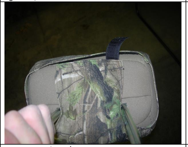
Step 15. Headrests/H: Connect the hook Velcro<sup>™</sup> to the loop Velcro<sup>™</sup> sewn inside the back edge as shown.