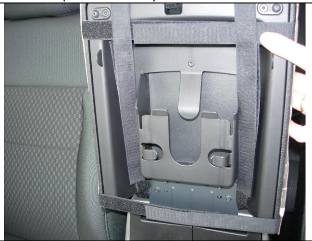
Step 16. Lid/L: Place the lid cover on as shown with the "L" marked inside to the back. Connect the Velcro™ under the lid. Re-connect the Velcro™ for the best fit.