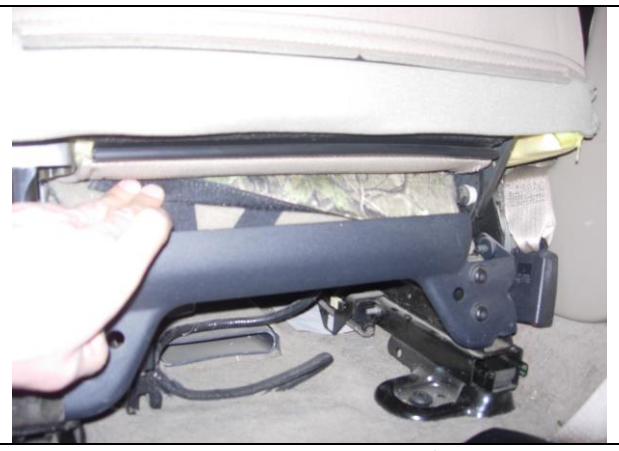
Step 13. Driver & Passenger Bottoms/DB&PB: Pull back on the fabric of the seat cover and press it to the carpet on the seat working from one side to the other. You may have to re-adjust the front, left and right side, and back Velcro™ for the best fit.