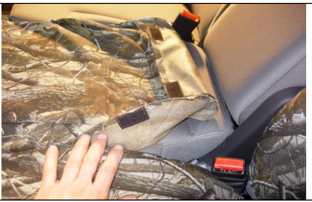
Step 12. Middle Bottom/MB. Place the cover over the front edge, line up the seams, pull it back and press the hook Velcro<sup>™</sup> to the carpet on the back edge of the seat.

Step 11. Driver & Passenger Tops/DT&PT: Again, line up the seams as in Step 2. fold the backrest forward and tuck the Velcro<sup>™</sup> into the seat and connect them to the loop Velcro<sup>™</sup> sewn inside the back edge. Do this by gently pulling on the Velcro<sup>™</sup> from behind with one hand while using your other hand in a smoothing action down the front from top to bottom.