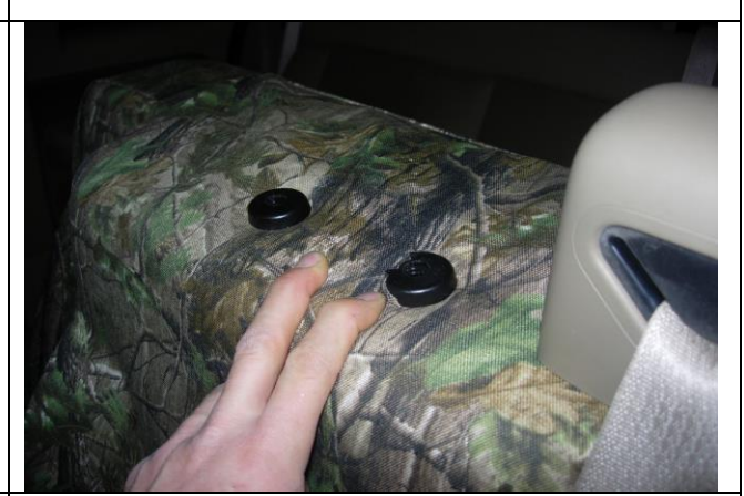
Step 8. Driver & Passenger Tops/DT&PT: Carefully open the seat cover bottom and side. Place the seat cover on with the hook fasteners to the front and tuck the cover between the seat belt and the seat as shown. Like Step 2, line up the seams of the seat cover to the seams of the seat.