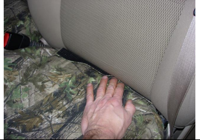
Step 6. Driver & Passenger Bottoms/DB&PB: Tuck the back edge of the seat cover into the seat. Pull back hard on the fabric of the seat cover and press it to the carpet on the seat working from one side to the other. You may have to re-adjust the front, left and right side, and back Velcro<sup>™</sup> for the best fit.

Step 7. Driver & Passenger Tops/DT&PT: Temporarily remove the headrests. Slide the seat forward and recline the backrest. Depress the push button releases on the plastic, and gently lift up. One release will be easily visible, the left side button is flush with the plastic and hard to see.