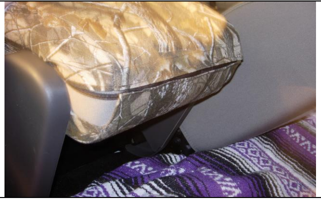
Step 14. Armrest/A: Move the armrest back and forth and carefully tuck the cover behind the plastic covers of the hinge area. connect the Velcro<sup>™</sup> on the back edge as shown.

Step 13. Armrest/A: Place the armrest cover on with the hook Velcro<sup>™</sup> to the front. As in Step 2, line up the seams of the armrest cover to the seams of the armrest.