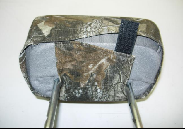
Step 16. Headrests/H: Connect the Velcro<sup>™</sup> in back as shown.

Step 15. Headrests/H: Slide the cover on with the hook Velcro<sup>™</sup> to the front. Notice how the headrest needs to be compressed to get the cover on. It relaxes back once the cover is pulled on.