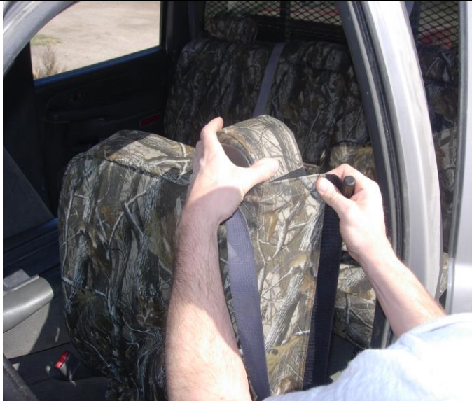
Step 13. Driver and Passenger Tops: First, connect the horizontal Velcro™ on the side of the seat.