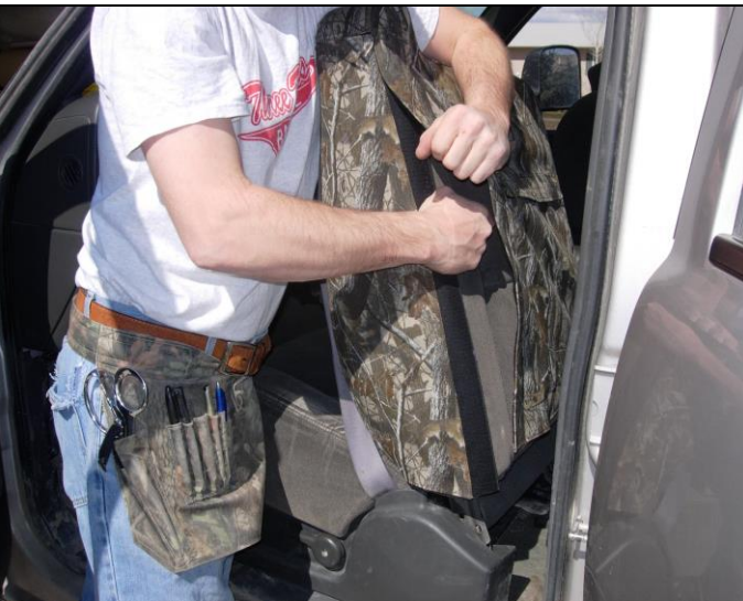
Step 15. Driver and Passenger Tops: Working from the top, fasten the Velcro™ a few inches at a time, using what I call a "bear hug" method" with some downward pressure.