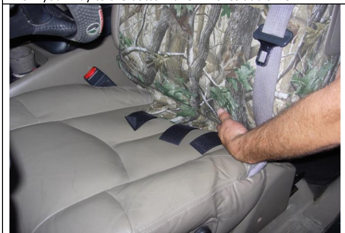
Step 9. Driver and Passenger Tops: Tuck the long hook Velcro™ into the seat.