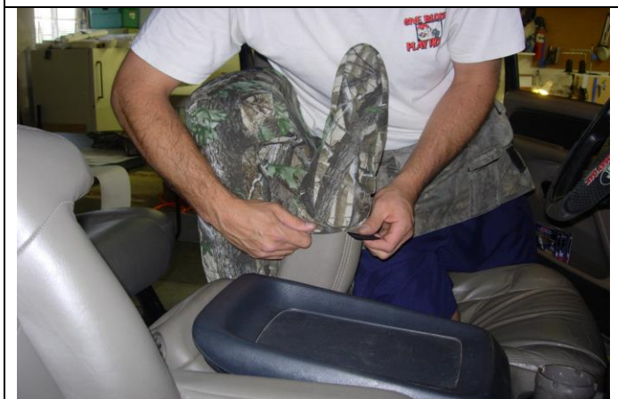
Step 11. Driver and Passenger Armrests/DA & PA: Slide the armrest cover on with the cut out for the hinge bolt on the inside.