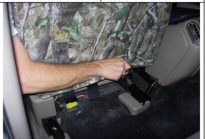
Step 10. Driver and Passenger Tops: Gently pull the Velcro™ from behind the seat with one hand and use your other hand in a smoothing motion from top to bottom to tighten the seat cover. Connect the Velcro™ starting in the middle working your way to the outside edge.