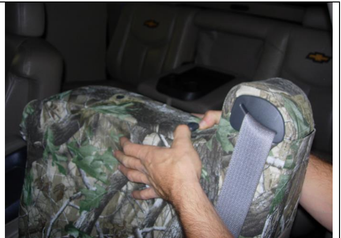
Step 8. Driver and Passenger Tops: Tuck the seat cover under the plastic for the headrests.