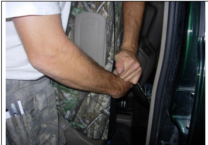
Step 7. Driver and Passenger Tops: Work your way to the bottom a few inches at a time.