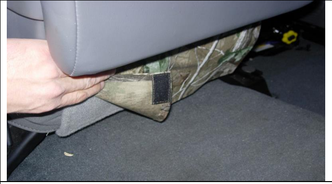
Step 12. Middle Bottom Back/MBB:

Lift the middle bottom up and place the Loop Velcro ^{\text{TM}} into the cavity of the middle bottom. Prepare the surface of the plastic the same as step 8. Fasten the adhesive hook Velcro ^{\text{TM}} to the inside of the plastic box.