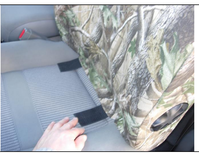
Step 6. Driver and Passenger Tops/DT&PT:

Temporarily remove the headrests by depressing the push button release and gently lifting up. Slide the seat cover on with the extending hook Velcro ^{\text{TM}} to the front. Tuck the seat cover under the plastic for the headrest starting with the push button release.