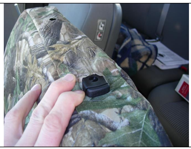
Step 5. Driver and Passenger Tops/DT&PT:

Temporarily remove the headrests by depressing the push button release and gently lifting up. Slide the seat cover on with the extending hook Velcro ^{\text{TM}} to the front. Tuck the seat cover under the plastic for the headrest starting with the push button release.