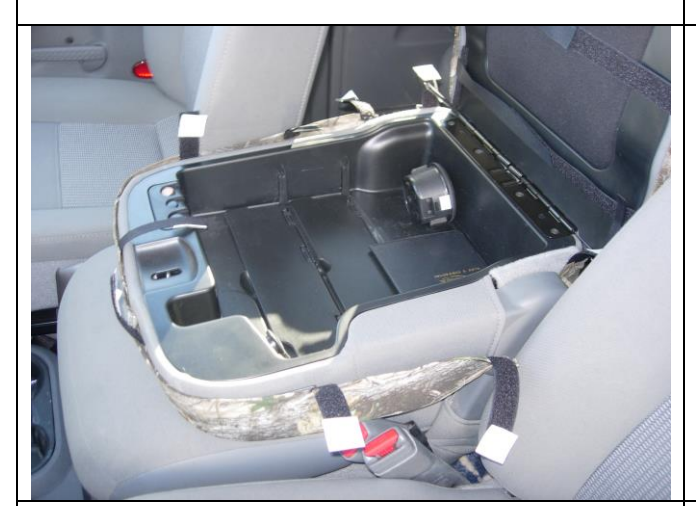
Step 7. Console/C:

Tuck the hook Velcro™ into the seat. Line up the seams of the seat cover to the seams of your seat, they should closely match. Gently pull on the hook Velcro™ with one hand from the back while sliding your other hand down the front of the seat cover taking up the slack in the seat cover. Lastly, mate the hook Velcro™ to the loop Velcro™ sewn inside the back edge.