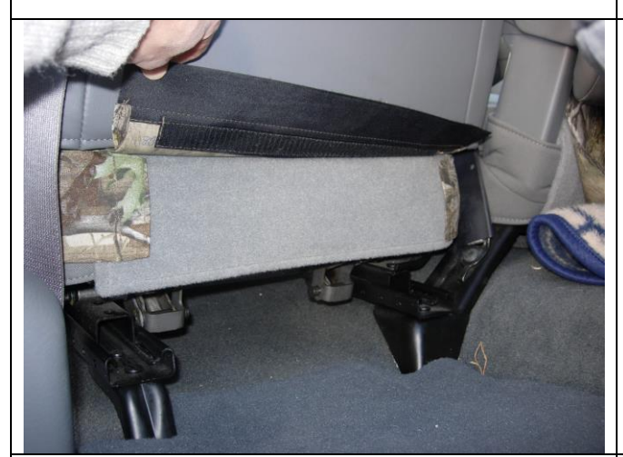
Step 3. Driver and Passenger Bottoms/DB&PB:

Slide the seat cover over the upholstered flap on the outside, then position the cut outs for the electric seat controls and recline lever. <u>Electric controls only:</u> Tuck the seat cover behind the electric control panel. Pull the outside edge of the seat cover back lining up the hole for the recline lever and press the hook (sticky) Velcro™ to the carpet on the back of the seat, or the Loop Velcro™ if no carpet exists.