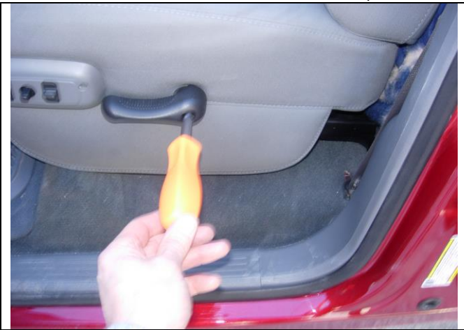
Step 1. Driver and Passenger Bottoms/DB&PB:

Items needed for the installation: Phillips screwdriver or cordless drill, rubbing alcohol, and paper towels.