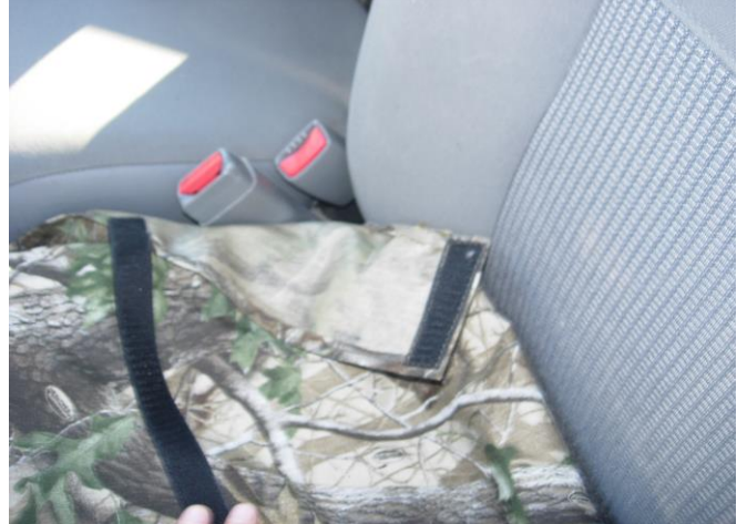
Step 4. Driver and Passenger Bottoms/DB&PB:

For Electric seats: Lift the seat up as high as it will go. Route the long hook Velcro™ under the front of the seat and press them to the carpet on the back edge of the seat, or the Loop Velcro™ if no carpet on the back of the seat. Make sure the Velcro™ is routed above any wires or bars. Next, pull the inside edge of the seat cover (next to the center console) around to the back and press it to the carpet or the Loop Velcro™.