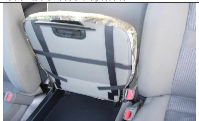
Step 13. Middle Bottom/MB:

Press the hook Velcro™ to the carpet on the back edge of the middle seat bottom.