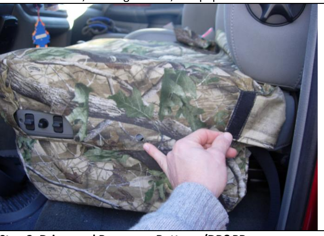
Step 2. Driver and Passenger Bottoms/DB&PB:

Temporarily remove the screw from the recline lever using a Phillips screwdriver.