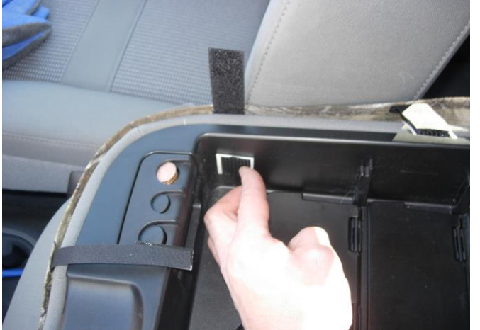
Step 8. Console/C:

With the console in the up position, slide the console cover on and tuck it in on the bottom. Fold the console down, holding it in position with one hand. Note where the Velcro™ will lay inside the cavity. Fasten the right side and left side rear hook tabs to the carpet behind the console hinge.