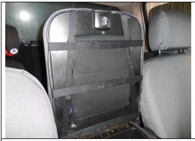
Step 9. Lid/L:

Connect the Velcro™ under the console lid starting with the top or front. The small rear Velcro™ slide into the hinge in back or bottom. Reposition the Velcro™ for the proper fit.