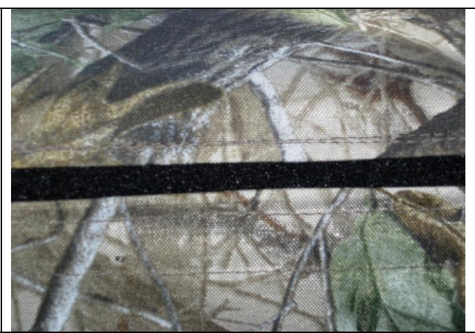
Step 10. Console Lid/L:

Connect the Velcro™ under the console lid starting with the top or front. The small rear Velcro™ slide into the hinge in back or bottom. Reposition the Velcro™ for the proper fit.