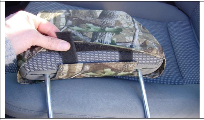
Step 14. Headrests/H:

Connect the Velcro<sup>™</sup> to the carpet on the bottom of the seat and the long Velcro<sup>™</sup> across the middle to each other.