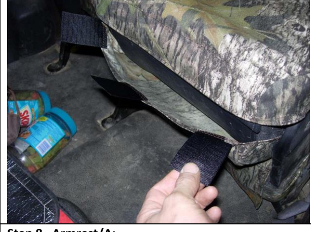
Step 8. Armrest/A: Fold the Armrest down, tuck the hook Velcro<sup>™</sup> thru to the back.