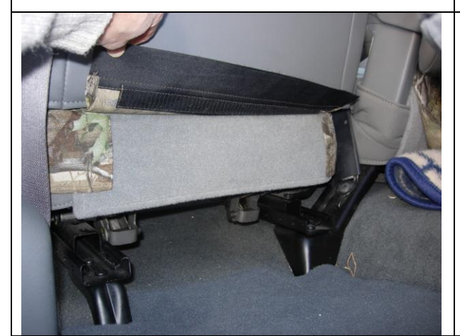
Step 3. Driver and Passenger Bottoms: Route the long hook Velcro™ under the front of the seat and stick them to the loop Velcro™ sewn on the back edge of the seat cover. Next, pull the inside edge of the seat cover (next to the center console) around to the back and connect the hook Velcro™ to the loop Velcro™ sewn on the back edge of the seat cover.