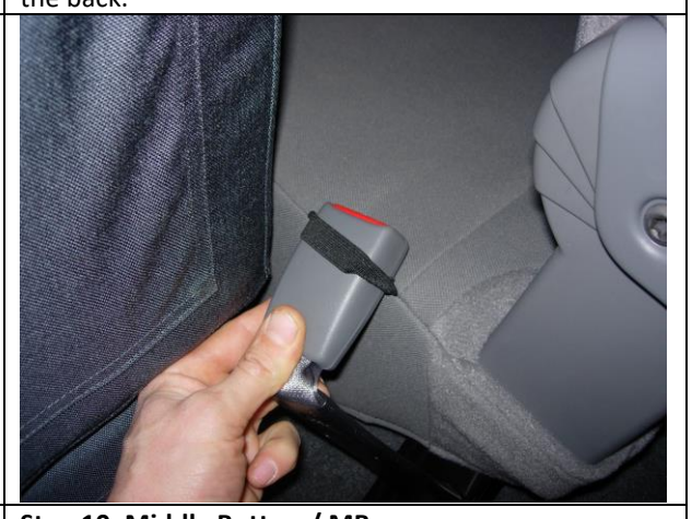
Step 10. Middle Bottom/ MB: Temporarily remove the seatbelt from its elastic restraint. Place the seat cover on with the long hook Velcro™ to the front.