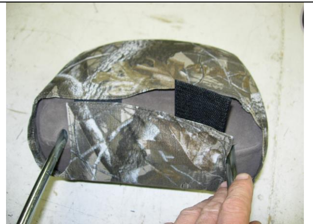
Step 15. Headrests:

Slide the headrest cover on with the hook Velcro^{TM} to the front, compressing the headrest to get the cover on. The headrest will relax back to its original shape once the cover is pulled all the way down.