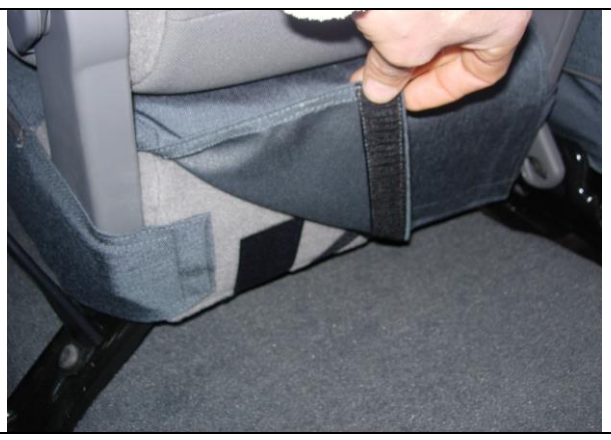
Step 12. Middle Bottom:

Pull the left and right sides of the seat cover around to the back and press them to the carpet on the seat, or the seat cover if it doesn't have carpet. Route the long hook Velcro™ under the front of the seat and connect them to the carpet. Route the long side hook Velcro™ under the seat and connect them at an angle to the