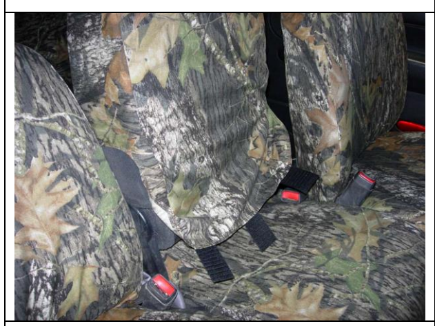
Step 7. Armrest/A: Carefully open and slide the cover on with the extending hook Velcro™ to the front as shown.