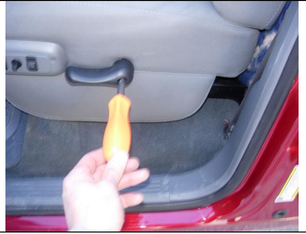
Step 1. Driver and Passenger Bottoms DB/PB: Use the "Seat Cover Piece Identification Chart" to indentify the different parts of the seat cover. Temporarily remove the recline lever using a Phillips screwdriver.