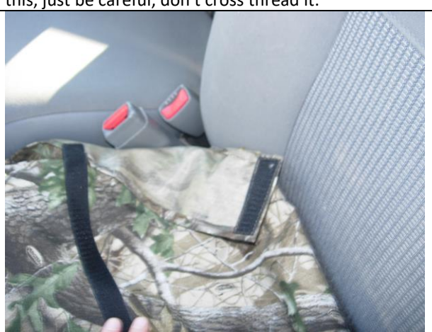
Step 4. Driver and Passenger Bottoms: Route the long inside and outside hook Velcro™ to the carpet on the back edge of the seat. Next, tuck the back edge of the seat cover into the seat, pull back, and press the hook Velcro™ to the loop Velcro™ sewn on the back of the seat cover. Connect the plastic buckles under the back of the seat to the rear foam support wire, then back to the loop Velcro™ on the back edge of the seat cover, trim the excess. Move the seat in all directions after installing to make sure the seat's action is not interfered with. Adjust the Velcro™ if needed to free the seats action or smooth out any wrinkles.