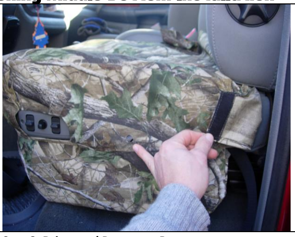
Step 2. Driver and Passenger Bottoms: Slide the seat cover over the upholstered flap on the outside, then position the cut outs for the recline lever. Note, this model seat doesn't have electric controls on the driver seat. Pull the outside edge of the seat cover back lining up the hole for the recline lever and press the hook (sticky) Velcro™ to the loop Velcro™ sewn on the back edge of the seat cover, then put the lever back on. A cordless drill works great for this, just be careful, don't cross thread it.