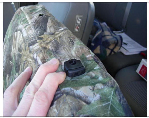
Step 5. Driver and Passenger Tops/ DT & PT: Temporarily remove the headrests by depressing the push button release, gently and evenly lifting up. Slide the seat cover on with the extending hook straps to the front. Tuck the seat cover under the plastic for the headrest starting with the push button release.