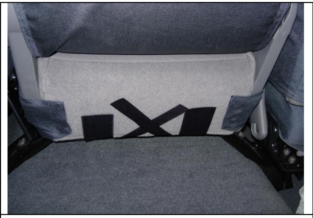
Step 11. Middle Bottom:

Pull the left and right sides of the seat cover around to the back and press them to the carpet on the seat, or the seat cover if it doesn't have carpet. Route the long hook Velcro™ under the front of the seat and connect them to the carpet. Route the long side hook Velcro™ under the seat and connect them at an angle to the