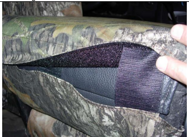
Step 9. Armrest/A: Pull the Velcro™ tight, tuck it under the back edge and connect the Velcro™ as shown.