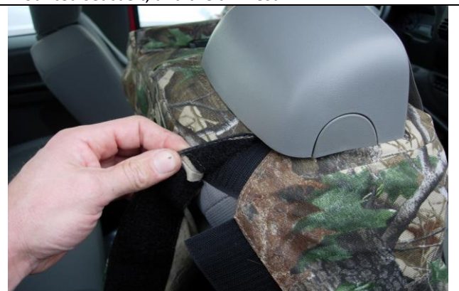
Step 4. Driver and Passenger Top/DT & PT:s: Connect the Velcro<sup>™</sup> behind the plastic seatbelt box on top of the seat.