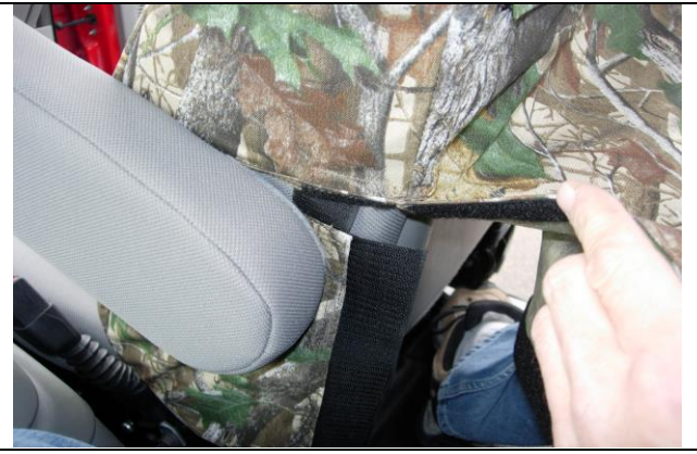
Step 5. Driver and Passenger Tops/DT & PT:: Connect the Velcro<sup>™</sup> behind the armrest, and down the inside.

Step 3. Driver and Passenger Tops/DT & PT:: Tuck the fabric under the plastic for the headrests and the shoulder mounted seatbelt.