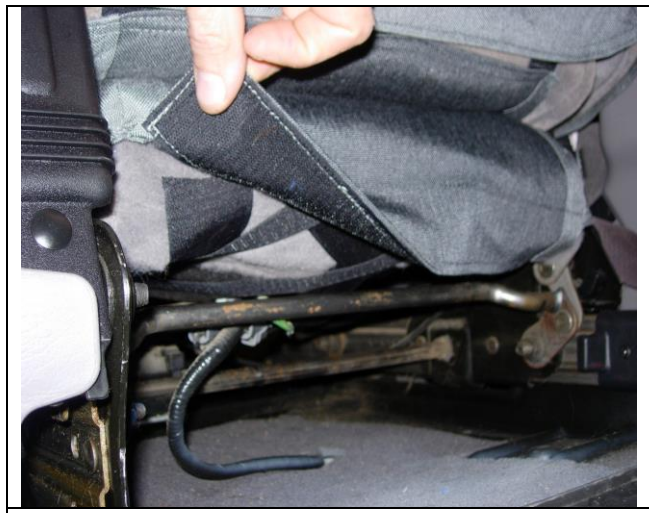
Step 15. Driver and Passenger Bottoms/DB &PB: Lastly, pull on the back edge of the seat cover with one hand and use the other hand in a smoothing action from front to back, taking up the slack in the seat cover, and then press the Velcro<sup>™</sup> to the carpet on the back edge of the seat.