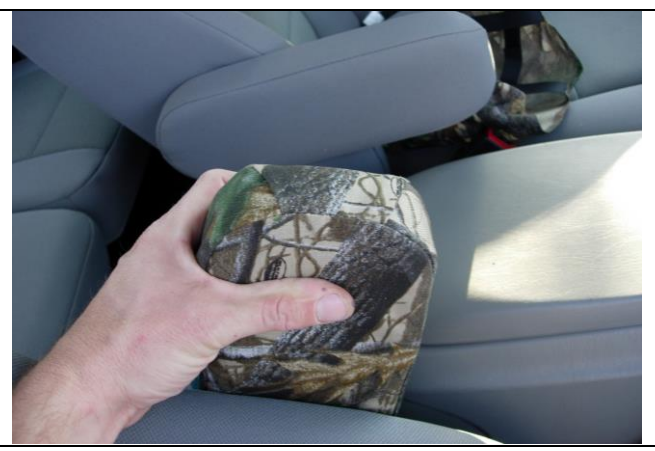
Step 22. Driver and Passenger Armrest/DA&PA: Recline the seats and slide the cover on with the opening towards the seat, pull it all the way down forming it to the front of the armrest with both hands.