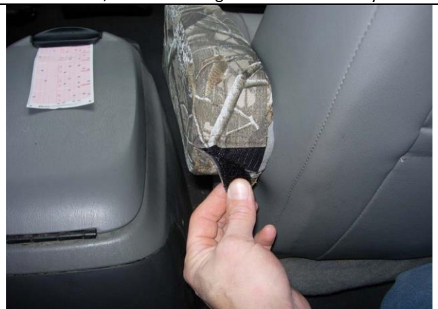
Step 23. Driver and Passenger Armrest/DA&PA: Connect the Velcro<sup>™</sup> behind the armrest.