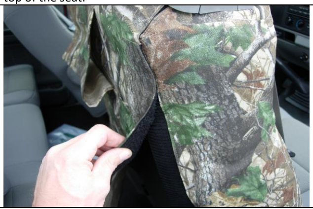
Step 6. Driver and Passenger Tops/DT & PT:: Connect the vertical Velcro<sup>™</sup> starting on top.