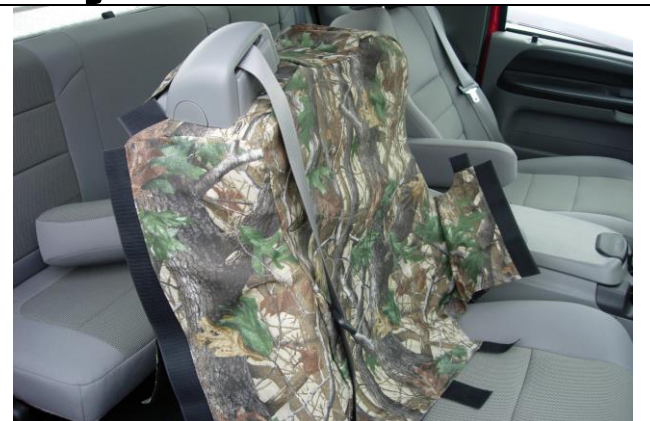
Step 2. Driver and Passenger Tops/DT & PT: The pieces of the seat cover are labeled inside. Use the "Seat Cover Piece Identification Chart" to identify the parts of your seat cover. Slide the seat cover on with the extending hook (sticky) Velcro™ to the front and tuck it behind the shoulder mounted seatbelt, and the armrest.