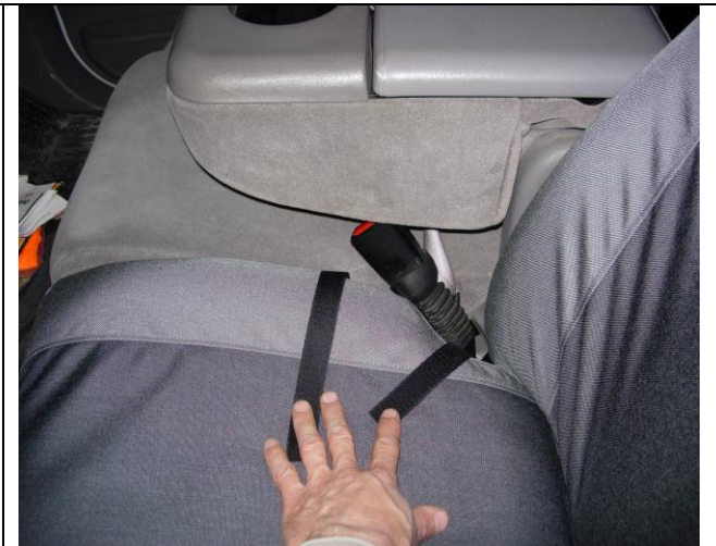
Step 12. Driver and Passenger Bottoms/DB &PB: Tuck the two long inside edge hook Velcro<sup>™</sup> down and under the seat. Route them carefully to the back edge of the seat and press them to the carpet on the seat. Some re-positioning of the Velcro<sup>™</sup> may be needed for the best fit.

Step 11. Driver and Passenger Bottoms/DB &PB: Route the long hook Velcro<sup>™</sup> under the front of the seat and connect them to the carpet on the back edge of the seat. For seats with electric controls, lift the seat up. Be sure to route the Velcro<sup>™</sup> between the seat and the moving metal framework (shown) allowing the seat to move freely. Use caution reaching under the seat to avoid sharp metal edges.