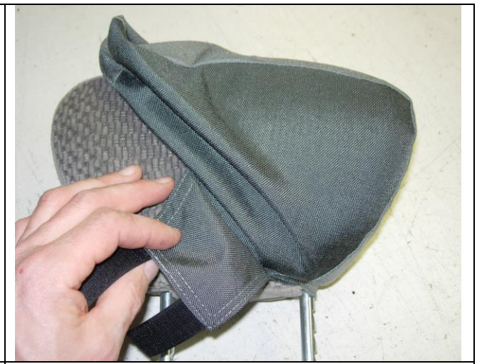
Step 16. Headrests/H: Open the headrest cover and slide it on one side with the extending hook Velcro<sup>™</sup> to the front. Form it to the corner as close as you can. The seams of the cover should closely match the seams of your headrest.