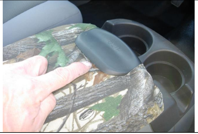
Step 20. Lid/L: First, tuck the fabric under the notebook clip.

Connect the corresponding Velcro<sup>™</sup> under the lid as shown. It will be a little tough at first to get it in place until you start connecting some Velcro<sup>™</sup>. Fasten a few, then the rest, and then re-tighten them all one by one.