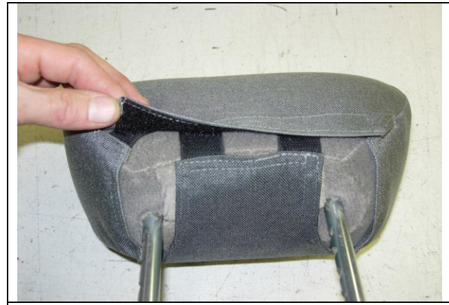
Step 19. Headrests: Connect the small side Velcro<sup>™</sup> first, and then connect the front hook Velcro<sup>™</sup>.