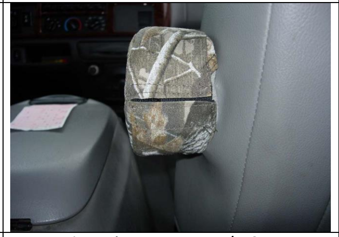
Step 24. Driver and Passenger Armrest/DA&PA: The material should be flush when you're done.