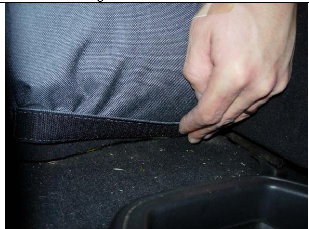
Step 18. Middle Bottom/MB: Roll the front of the cover over and press the hook Velcro™ to the carpet on the front of the middle bottom.