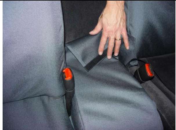
Step 16. Middle Bottom/MB: Tuck the back edge in.