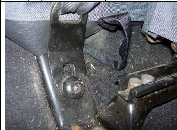
Step 19. Middle Bottom/MB: Fold the side Velcro™ in half lengthwise with the sticky facing in. Poke it thru to the backside.