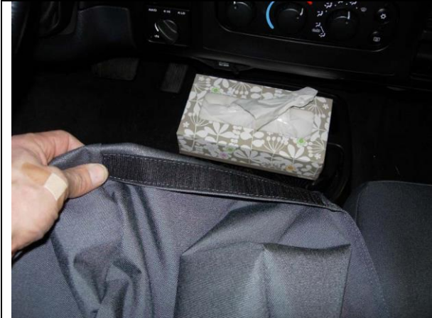
Step 15. Middle Bottom/MB: Turn the front of the cover inside out for now.