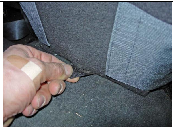
Step 20. Middle Bottom/MB: Pull the side Velcro around to the back at an angle, and press it to the carpet as shown