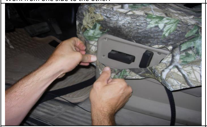
Step 15. Driver and Passenger Bottoms with elec. controls: Place the seat covers on with the long 2" wide hook Velcro™ to the front. Electric: Tuck the fabric under the front of the plastic first.

Temporarily loosen the screws on the electric control panel but don't remove them.