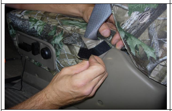
Step 17. Driver and Passenger Bottoms: Mate the Velcro™ behind the seat belt as shown.