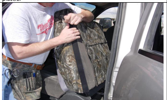
Step 6. Driver and Passenger Tops:

Hold the top part in place with one hand, connect the Velcro^{TM} with the other.