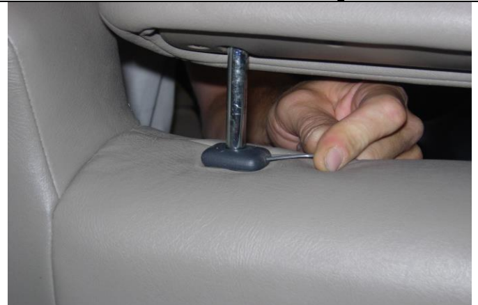
Step 1. Driver and Passenger Tops/DT & PT:

Temporarily remove the headrests by lifting it up all the way and inserting a heavy paper clip into the holes in the plastic as shown. Do this one at a time, gently lifting up and holding pressure until the headrest releases.