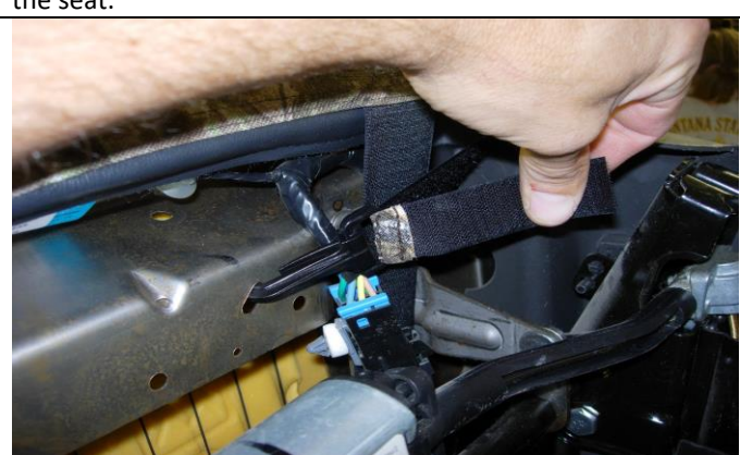
Step 23. Driver and Passenger Bottoms:

Pull the rear edge of the seat cover back forcibly and mate the hook Velcro™ to the carpet on the back edge of the seat. Using one hand in a smoothing action from front to back will help tighten the seat cover and remove wrinkles.