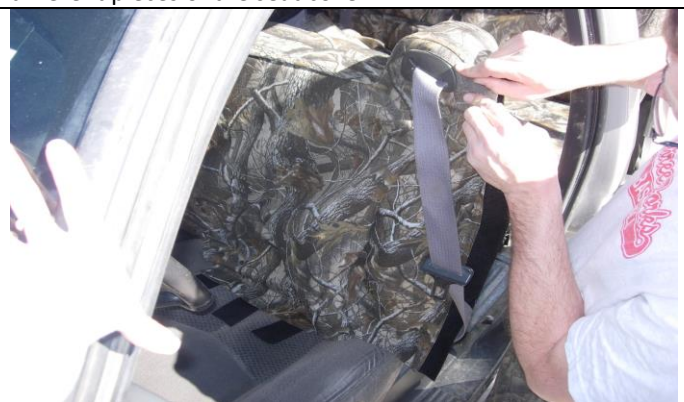
Step 3. Driver and Passenger Tops:

Carefully open the seat cover top. Place the seat cover on with the long hook Velcro™ to the front. Lean into the vehicle and pull the inside of the cover next to the console all the way down. Tuck the seat cover between the seat belt and the seat. Tuck the seat cover under the plastic for the headrests.