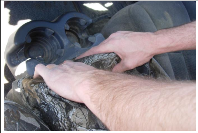
Step 10. Middle Bottom/MB:

Gently pull the Velcro<sup>TM</sup> from behind the seat with one hand and use your other hand in a smoothing motion from top to bottom to tighten the seat cover. Connect the Velcro<sup>TM</sup> starting on one side, working your way to the other side.