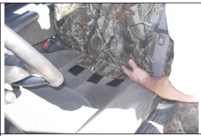
Step 8. Driver and Passenger Tops:

Keep working your way to the bottom a few inches at a time. Use some downward pressure when connecting the Velcro™.