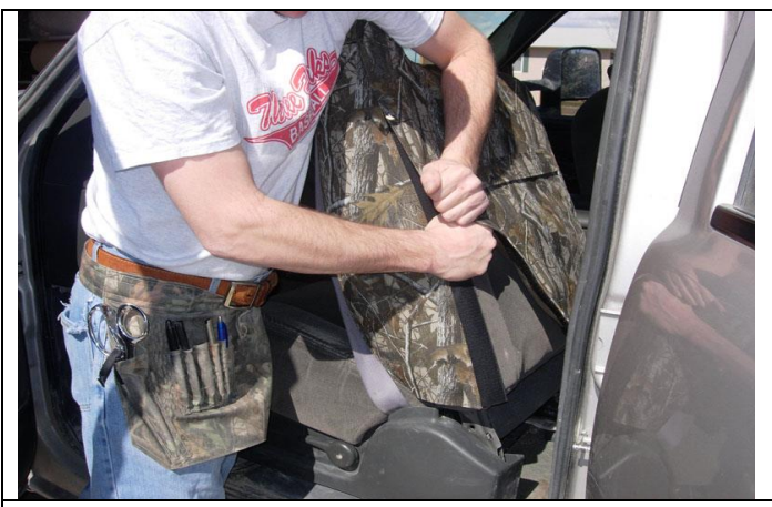
Step 7. Driver and Passenger Tops:

Keep working your way to the bottom a few inches at a time. Use some downward pressure when connecting the Velcro™.