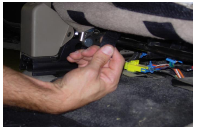
Step 21. Driver and Passenger Bottoms:

Tuck the long inside hook Velcro<sup>™</sup> down and under the seat.