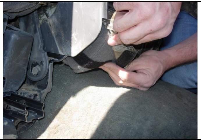
Step 13. Middle Bottom:

Route the short loop Velcro ^{\text{TM}} around the back corner and connect it to the hook Velcro ^{\text{TM}} sewn inside the back edge. Work from one side to the other.