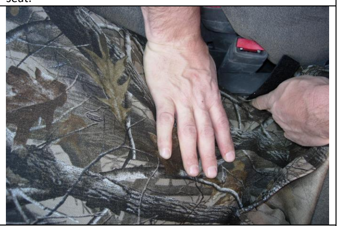
Step 12. Middle Bottom:

Tuck the sides of the seat cover in behind the plastic of the console hinge as shown.