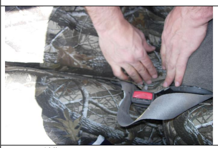
Step 11. Middle Bottom:

Slide the passenger and driver seats all the way forward and get into the back seat area. Working from behind the console area, lean over and tuck the front of the middle bottom seat cover behind the plastic drink holders as shown. Route the long front hook Velcro™ under the seat and connect them to the carpet on the back edge of the seat.