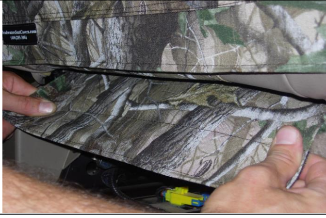
Step 22. Driver and Passenger Bottoms:

Route the long hook Velcro^{TM} in front under the seat and connect them to the carpet on the back edge of the seat. Feel under the seat for the left and right side hook Velcro^{TM} , connect them at an angle to the carpet on the back edge of the seat.