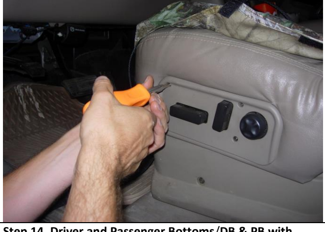
Step 14. Driver and Passenger Bottoms/DB & PB with electric seat controls:

Route the short loop Velcro ^{\text{TM}} around the back corner and connect it to the hook Velcro ^{\text{TM}} sewn inside the back edge. Work from one side to the other.