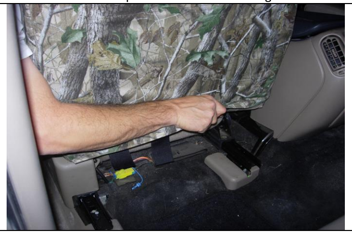
Step 9. Driver and Passenger Tops:

Tip the backrest forward and tuck the long hook Velcro™ into the seat.