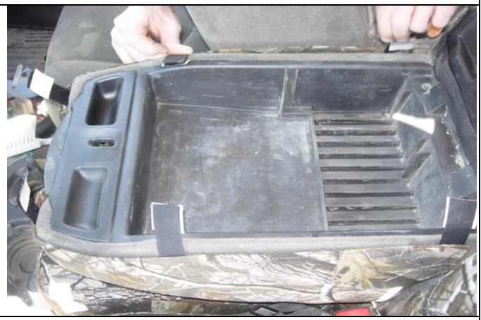
Step 28. Console:

Slide the covers on with the extending hook Velcro ^{\text{TM}} to the front. Using the corner of a table helps. Connect the Velcro ^{\text{TM}} in back.