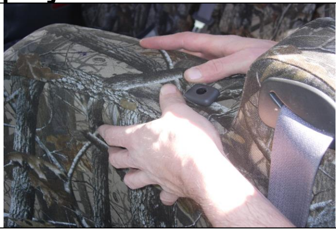
Step 2. Driver and Passenger Tops:

The pieces of the seat cover are labeled inside the seat cover. Use the "Seat Cover Piece Identification Chart" to identify the different pieces of the seat cover.