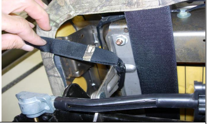
Step 24. Driver and Passenger Bottoms:

View of under the front of the driver's seat. Push the plastic hook into the oblong hole, pull it tight, connect the Velcro<sup>™</sup> and trim the excess. If no hole exists, use step 24.