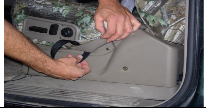
Step 19. Driver and Passenger Bottoms:

Lift the seat all the way up (towards the roof) using the electric controls. Slide the long outside edge hook Velcro^{TM} in where shown.