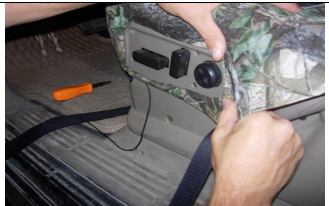
Step 16. Driver and Passenger Bottoms with elec. controls: Tuck the fabric under the back, top, and bottom of the plastic. Tighten the screws on the plastic panel. Manual seat controls: Connect the Velcro™ below the lumbar knob.