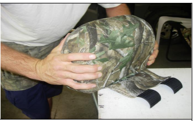
Step 26. Headrests/H:

Place the 1" square adhesive hook Velcro™ at the end of the Velcro™ and peel off the backing.