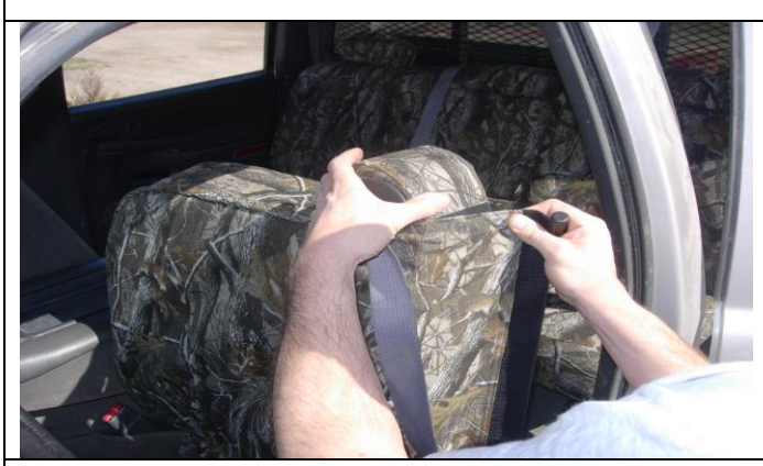
Step 5. Driver and Passenger Tops:

Carefully use a flat screw driver to finish tucking the seat cover behind the plastic on the top side of the seat belt plastic.