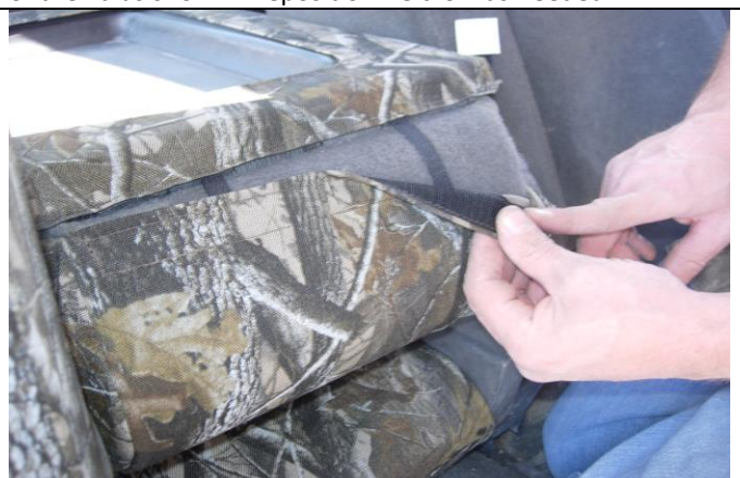
Step 27. Console/C:

Put the cover for the lid on with the console in the down position. Fold it up and mate the Velcro™ on the underside of the lid as shown. Reposition Velcro™ as needed.