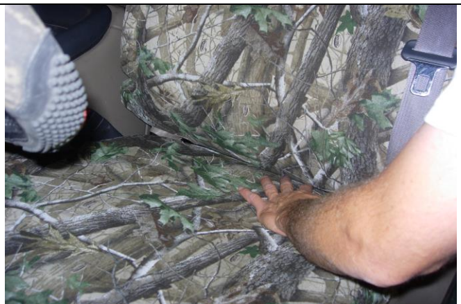
Step 18. Driver and Passenger Bottoms:

Tip the back of the seat bottom down using the electric controls and tuck the back edge of the seat cover into the seat.