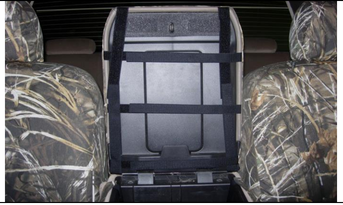
Step 25. Lid/L:

Put the cover for the lid on with the console in the down position. Fold it up and mate the Velcro™ on the underside of the lid as shown. Reposition Velcro™ as needed.