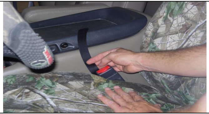
Step 20. Driver and Passenger Bottoms:

Lift the seat all the way up (towards the roof) using the electric controls. Slide the long outside edge hook Velcro^{TM} in where shown.