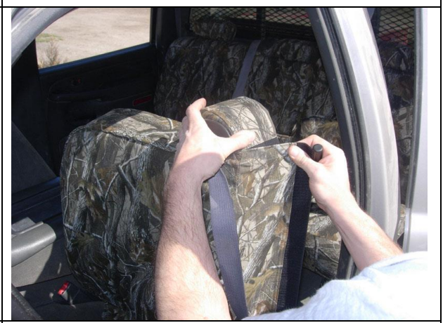
Step 4. Driver & Passenger Tops/DT & PT: Hold the top part in place with one hand and then connect the vertical Velcro<sup>™</sup> with the other.