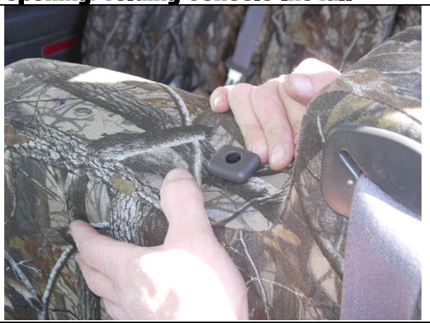
Step 2. Driver & Passenger Tops/DT & PT Carefully open the seat cover top and slide the seat cover on with the long hook Velcro<sup>™</sup> to the front. Lean into the vehicle and pull the inside of the cover next to the console all the way down. Next, tuck the fabric under the plastic for the headrests.

The pieces of the seat cover are labeled inside the seat cover. Use the "Seat Cover Piece Identification Chart" to identify the different pieces of the seat cover.