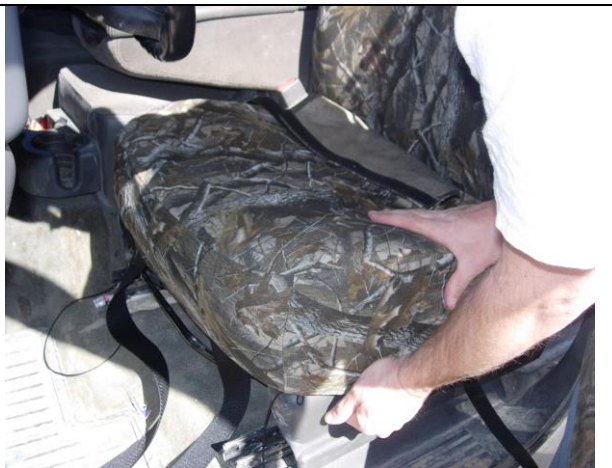
Step 8. Driver and Passenger Bottom/DB & PB: Place the seat cover bottoms on with the long hook (sticky) Velcro<sup>™</sup> to the front.

Step 7. Driver and Passenger Tops/DT & PT: Gently pull the Velcro<sup>™</sup> from behind the seat with one hand while using your other hand in a smoothing action in front of the seat from top to bottom. Tuck the Velcro<sup>™</sup> under the back edge and starting on the inside and work your way out.