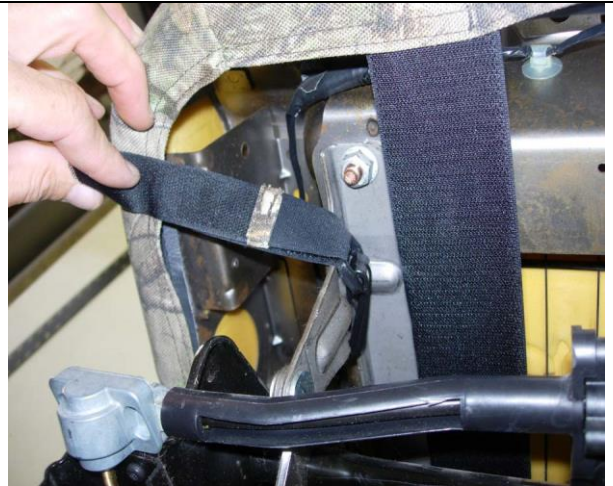
Step 11. Driver and Passenger Bottom/DB & PB: View from under the front of the driver's seat. Clip the plastic buckle over the metal as shown, then press the Velcro<sup>™</sup> together and trim the excess.