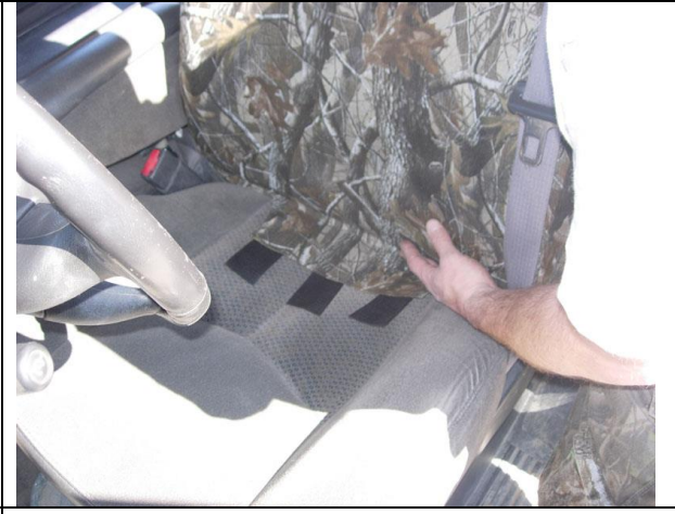
Step 6. Driver & Passenger Tops/DT & PT: Line up the seams of the seat cover to the seams of the seat, they should closely match. Next, tilt the backrest forward and tuck the extending hook (sticky) Velcro<sup>™</sup> into the seat.

Step 5. Driver & Passenger Tops/DT & PT: Connect the vertical Velcro<sup>™</sup> by using a bear hug method starting at the top working your way down a few inches at a time.