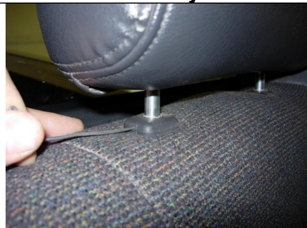
Step 1. Driver & Passenger Tops/DT & PT Temporarily remove the headrests by lifting it up all the way and inserting a heavy paper clip into the holes in the plastic as shown. Do this one at a time, gently lifting up and holding pressure until the headrest releases.

The pieces of the seat cover are labeled inside the seat cover. Use the "Seat Cover Piece Identification Chart" to identify the different pieces of the seat cover.