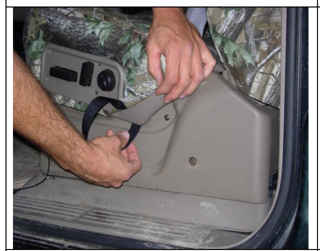
Step 11. Driver and Passenger Bottom/DB & PB: Slide the outside edge hook Velcro<sup>™</sup> up between the seat and the plastic. Carefully reach under the seat for the Velcro<sup>™</sup> and connect it at an angle to the carpet on the back edge.