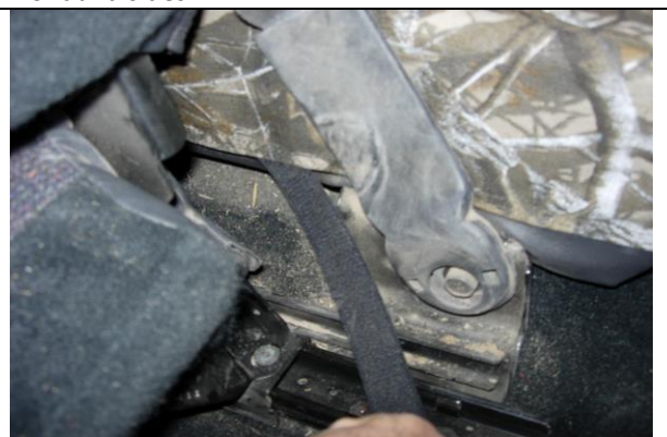
Step 15. Middle Bottom/MB: Route the side Velcro<sup>™</sup> at an angle to the carpet in back, and then tuck in the rear edge of the cover and pull back, connecting it to the carpet.

Step 14. Middle Bottom/MB: Slide the driver and passenger seats all the way forward and place the cover on with the extending hook Velcro<sup>™</sup> to the front. Tuck the cover behind the plastic drink holders and line up the seams along the front and sides.