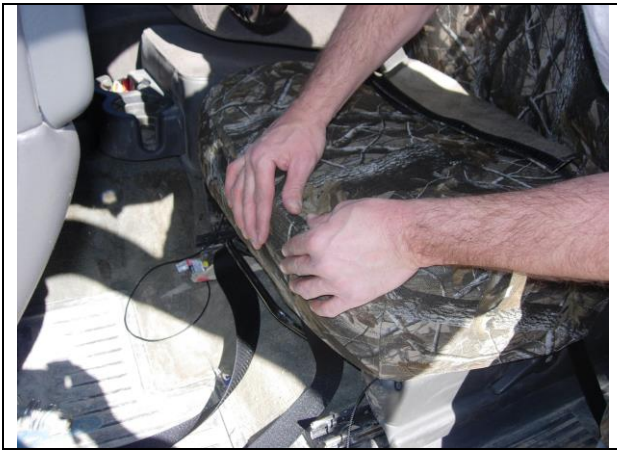
Step 9. Driver and Passenger Bottom/DB & PB: Work the material from the seam inside the seat cover from the inside to the outside edge (thumbs to fingers). Line up the seams of the seat cover to the seams of your seat, they should closely match. Mate the Velcro<sup>™</sup> behind where the seatbelt comes out of the seat bottom. Tuck in the back edge and pull it back but don't fasten it yet.