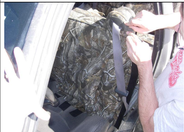
Step 3. Driver & Passenger Tops/DT & PT: Tuck the fabric under the plastic for the shoulder mounted seatbelt using a sawing motion to start, and then carefully use a thin metal object like a feeler gauge or a flat screwdriver to finish tucking the material.