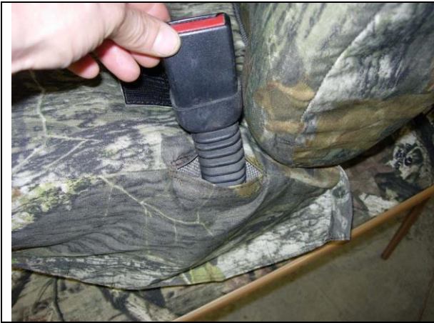
Step 7. Passenger Bottom/PB: Place the seat cover over the opening for the inside edge seat belt.