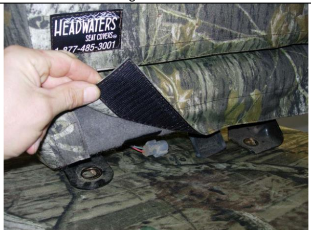
Step 16. Passenger Bottom/PB: Pull the rearmost edge of the seat cover back hard and press it onto the carpet on the back edge.