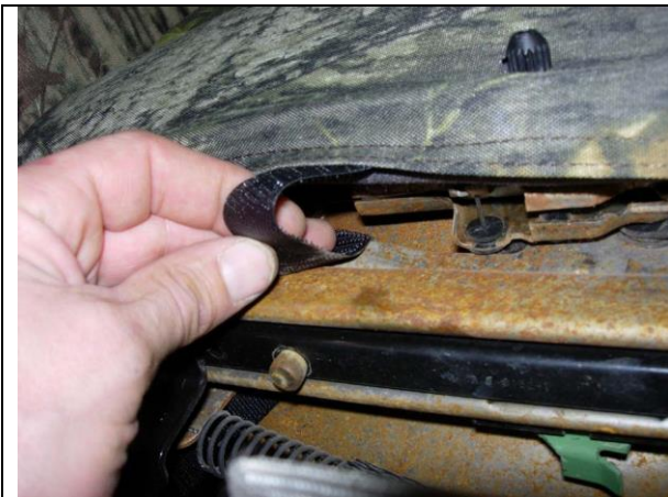
Step 13. Passenger Bottom/PB: Slide the side hook Velcro™ over the seat slides.