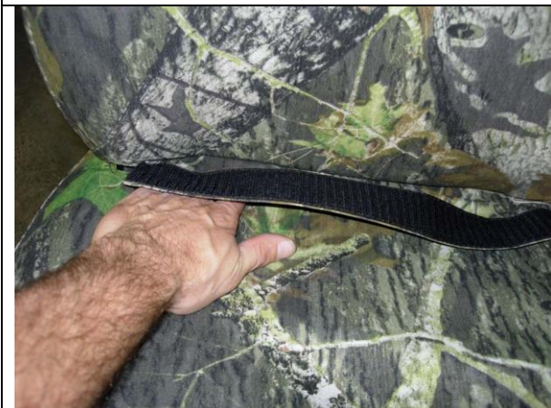
Step 15. Passenger Bottom/PB: Tuck in the back edge of the seat cover.