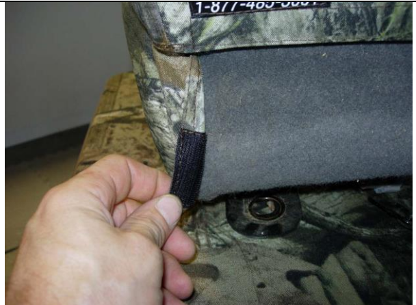
Step 12. Passenger Bottom/PB: Pull the inside around to the back hard, then press the hook Velcro™ onto the seat in back as shown.