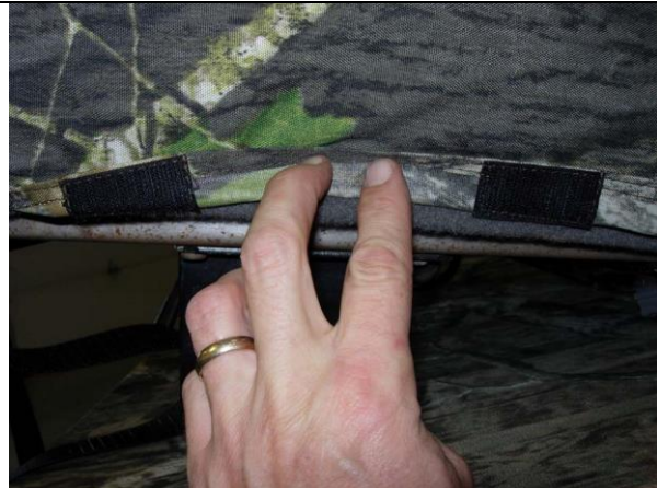
Step 11. Passenger Bottom/PB: Lift the hook Velcro™ away from the carpet on the side of the seat.