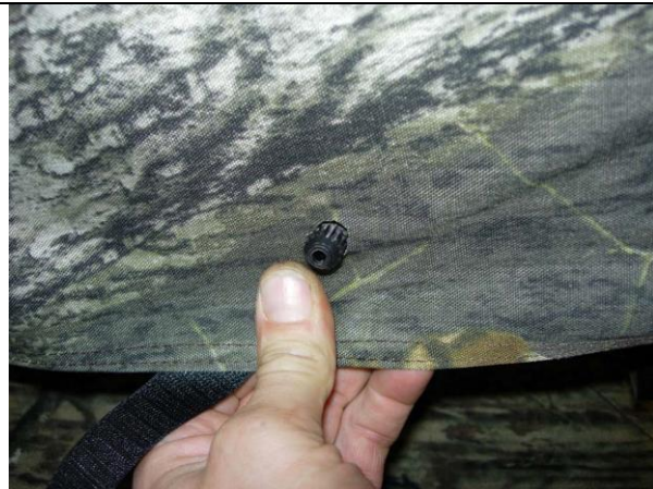
Step 9. Passenger Bottom/PB: Line up the hole for the recline lever.