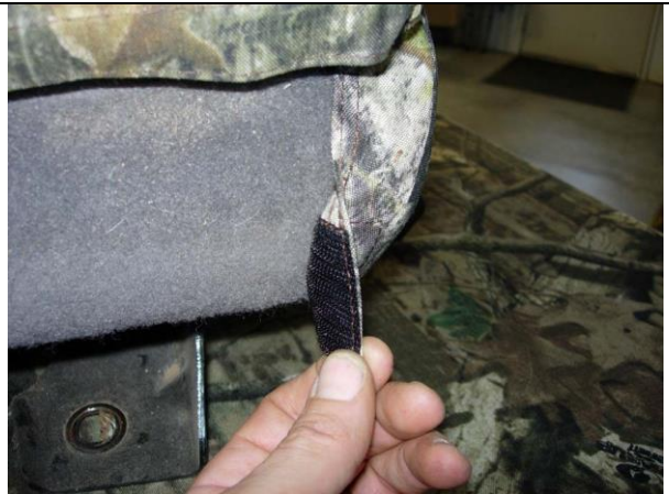
Step 10. Passenger Bottom/PB: Pull the seat cover around to the back and press the hook Velcro™ to the carpet on the seat. Put the recline lever back on.