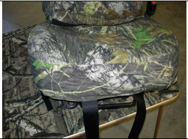
Step 8. Passenger Bottom/PB: Pull the seat cover back and as in Step 4, line up the seams of the seat cover to the seams of the seat.