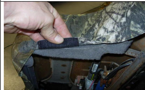
Step 17. Driver Bottom/DB: Follow Steps 8-16, except for 7&12. Shown is the notched out area on the right leg of the driver. Press the hook Velcro™ to the carpet on the seat.