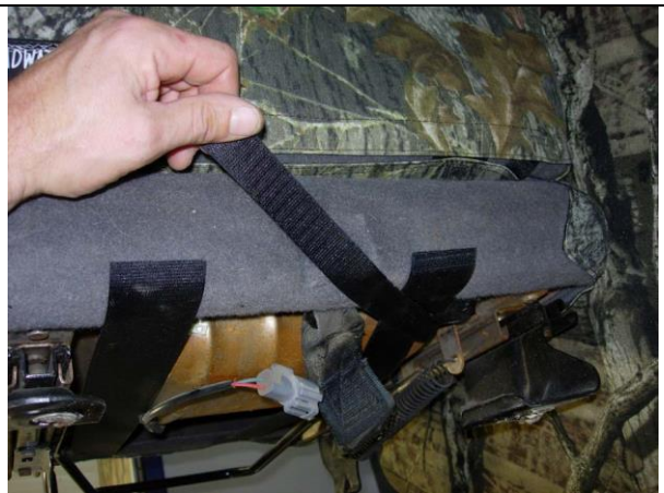
Step 14. Passenger Bottom/PB: Route them at an angle to the back edge and press them onto the carpet. Reconnect the outside edge of the seat and slide your hand along the recline lever to smooth the outside edge of the seat cover.