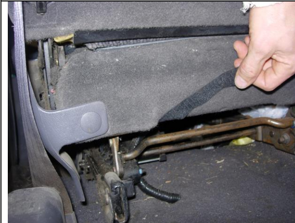
Step 7. Driver Bottom/DB: For models with electric controls, lift the seat all the way up towards the ceiling. Carefully reach under the seat and feel for the Velcro™. Route it where shown, on top of the metal frame and press it to the carpet on the back of the seat. For models with manual controls, route it straight back inside the plastic and mate it where you see the plastic wrapping around the back of the seat (left side of the photo) Move the seat to make sure the seat action is not impeded by the Velcro™.