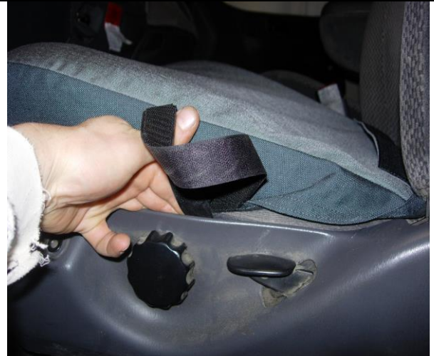
Step 6. Driver Bottom/DB: Slide the long outside edge hook Velcro™ down between the seat and the plastic. Loosening the screw behind the recline lever helps.