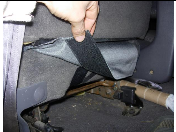
Step 8. Driver Bottom/DB: Lastly, pull the back edge of the seat cover back and press the hook Velcro™ to the carpet, starting on one side moving to the other. Some repositioning of the Velcro™ may be needed to get the best fit. Gently slide the seat back and forth to make sure the Velcro™ are not impeding the seats actions. Re-route the Velcro™ as needed.