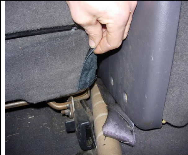
Step 5. Driver Bottom/DB: Pull the inside edge back and press the hook Velcro™ to the carpet on the seat as shown.