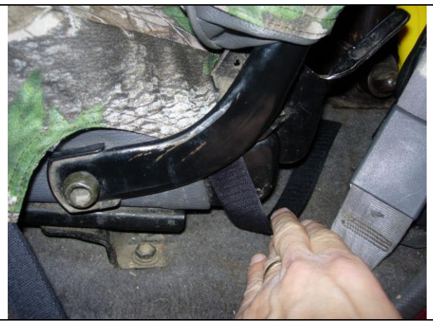
Step 9. Bottom/B Route the rear most side hook Velcro<sup>™</sup> behind the hinge arm and route it around the back corner.