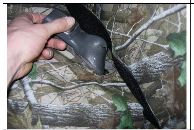
Step 5. Bottom/B Feed the seat belts through the provided openings.

Tuck the hook Velcro<sup>™</sup> into the seat, routing them under the bar. Use one hand in a smoothing action down the front of the seat from top to bottom, while gently pulling on the Velcro<sup>™</sup> with the other hand from behind. Pin it to the seat with the front hand and press the Velcro<sup>™</sup> together. Work from one side to the other.