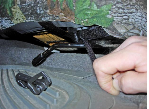
Step 15. Bottom/B View of rear buckle.