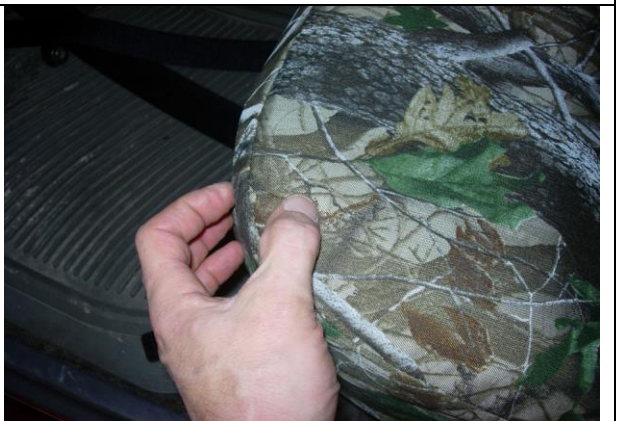
Step 6. Bottom/B Work the fabric inside the seat cover seam outward, or from thumb to forefinger.