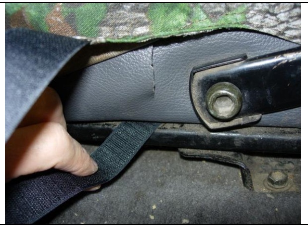
Step 8. Bottom/B Route the hook Velcro<sup>™</sup> between the seat slide and the seat, just in front of the hinge arm.