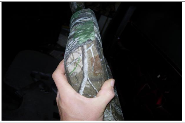
Step 2. Top/T Pull the cover down and form it to the integral headrests.

Both parts of the seat cover are labeled inside. "T" is for top, and "B" is for the bottom. Place the top on with the extending hook Velcro™ to the front.