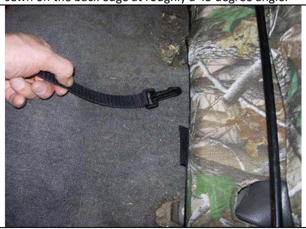
Step 12. Bottom/B Connect the three plastic buckles under the back edge of the seat. One in the middle, one for passenger, and one for the driver side. See step 15 for view.