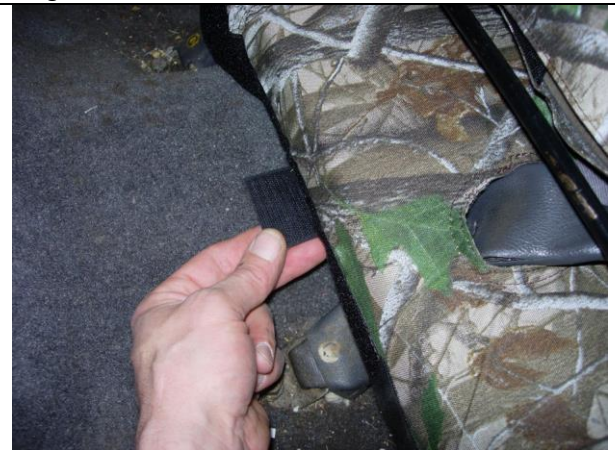
Step 11. Bottom/B Slide the seat all the way forward and route the long front hook Velcro<sup>™</sup> under the seat. Mate them to the loop Velcro<sup>™</sup> on back. The two center Velcro<sup>™</sup> route easiest along the transmission hump.