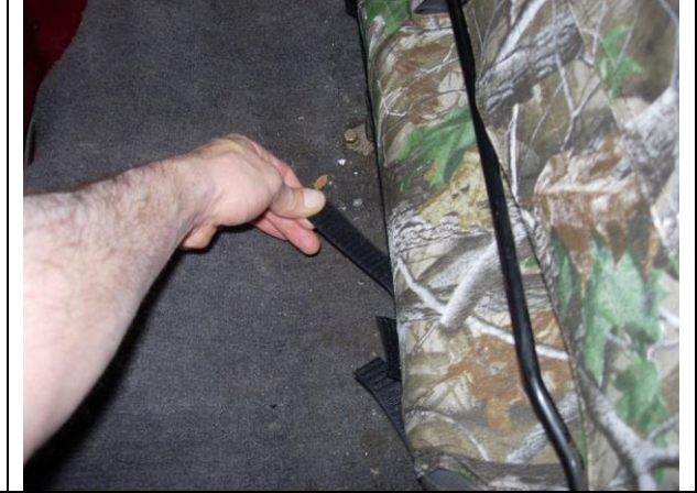
Step 10. Bottom/B Mate both side hook Velcro<sup>™</sup> to the loop Velcro<sup>™</sup> sewn on the back edge at roughly a 45 degree angle.