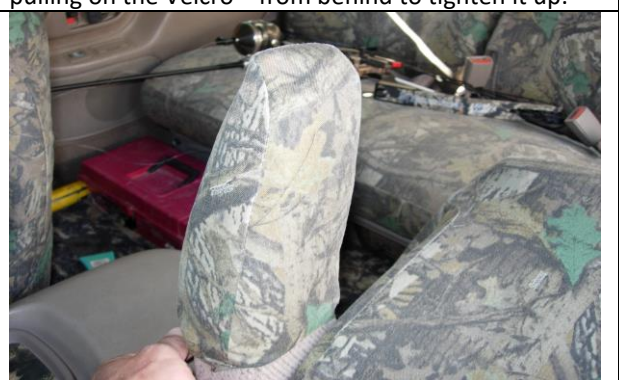
Step 9. Armrests/A:

Once the cover is snug, use your hand to follow the hook Velcro™ to the back (shown), tucking it under the back edge and connecting it to the loop Velcro™ sewn inside. EXT CAB ONLY: Put the access levers back on the outside edge of the backrest.