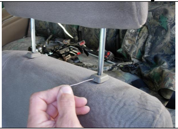
Step 1. Driver & Passenger Tops/DT & PT:

Temporarily remove the headrests by lifting them up all the way. Using gentle upward pressure, insert a heavy paper clip or piece of wire into the hole in the plastic until it releases. Keep holding upward pressure and release the other post. Repeat the procedure until the headrest releases completely.