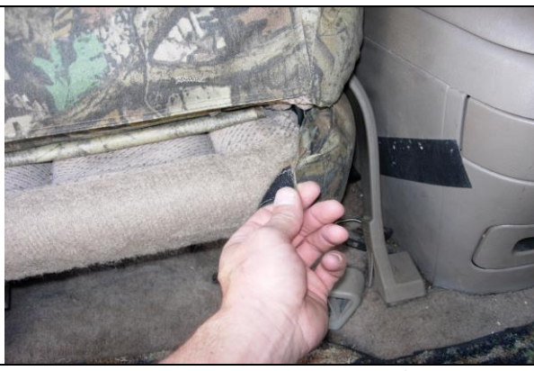
Step 16. Driver and Passenger Bottoms/DB & PB: Pull the inside edge (next to the console) of the cover back and press it to the carpet on the back of the seat. Next, do the same for the outside edge of the cover.