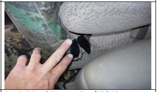
Step 6. Driver & Passenger Tops/DT & PT:

Tuck this hook Velcro™ under the armrest, and slide the seat all the back.