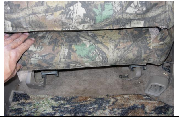
Step 23. Driver and Passenger Bottoms/DB & PB: With the seat cover in position, everything is covered and looking good.