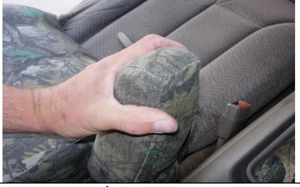
Step 10. Armrests/A:

Recline the backrests all the way. Slide the armrest covers on with the opening to the inside. They are VERY snug to slide on, so be patient.