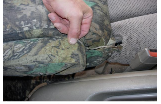
Step 12. Armrests/A:

Pull the back of the armrest cover over and form the cover to the armrest, ling up the seams.