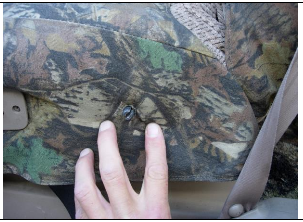
Step 14. Driver and Passenger Bottoms/DB & PB: Locate the hole provided for the recline lever, feeding the post for the lever through the hole. Install the recline lever onto the seat.