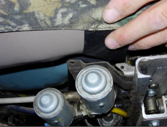
Step 20. Driver and Passenger Bottoms/DB & PB: Route the remaining front hook Velcro™ between the seat and the mechanisms as shown. Be sure the Velcro™ has a straight shot to the back edge.