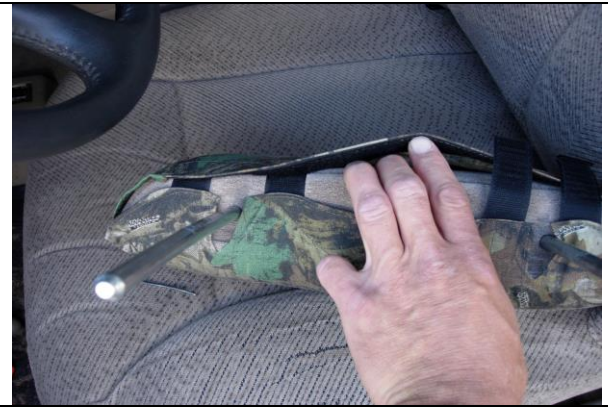
Step 24. Headrests/H: Slide the headrest covers on with the long extending hook Velcro™ to the front. Connect them to the loop Velcro™ sewn inside the back edge. Re-install the headrests back into the seat.