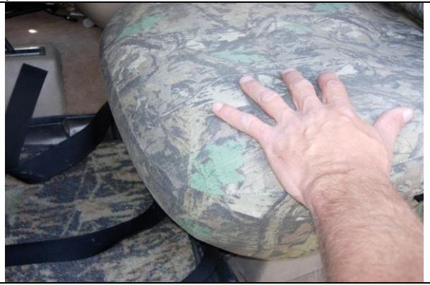
Step 15. Driver and Passenger Bottoms/DB & PB: Pull on the back edge of the cover and make sure it's all the way back and snug to the front of the seat.