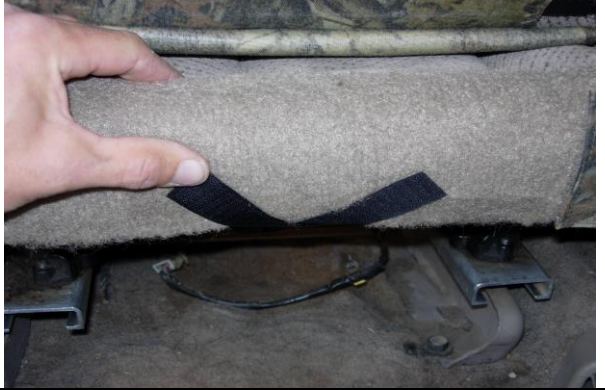
Step 18. Driver and Passenger Bottoms/DB & PB: press the long side hook Velcro™ in a crossing fashion forming an "X" on the carpet on the back edge of the seat