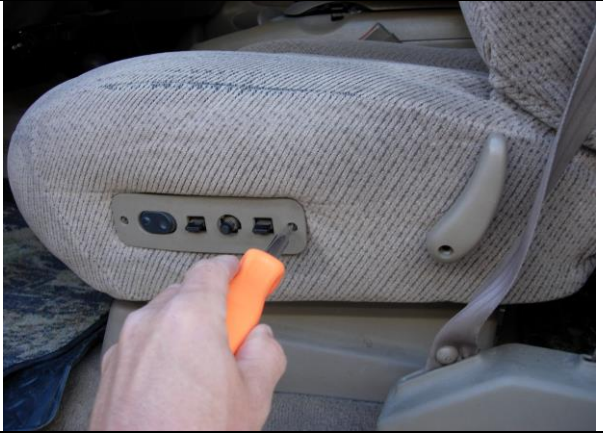
Step 2. Driver & Passenger Bottoms/DB & PB:

Temporarily remove the headrests by lifting them up all the way. Using gentle upward pressure, insert a heavy paper clip or piece of wire into the hole in the plastic until it releases. Keep holding upward pressure and release the other post. Repeat the procedure until the headrest releases completely.