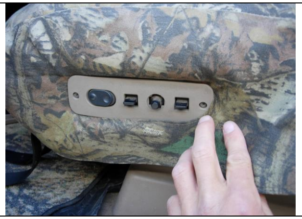
Step 13. Driver and Passenger Bottoms/DB & PB: Seats with electric controls: Lift seats up all the way and slide forward. Slide the seat covers with the long extending hook Velcro™ to the front. Tuck the fabric behind the plastic control panel's one corner at a time, starting on the front. Tighten the screws on the panels.