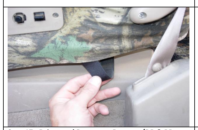
Step 17. Driver and Passenger Bottoms/DB & PB: Route the long side hook Velcro™ under the seat, avoiding the mechanisms, at an angle to the back edge to the seat. NOTE: The passenger side doesn't have an