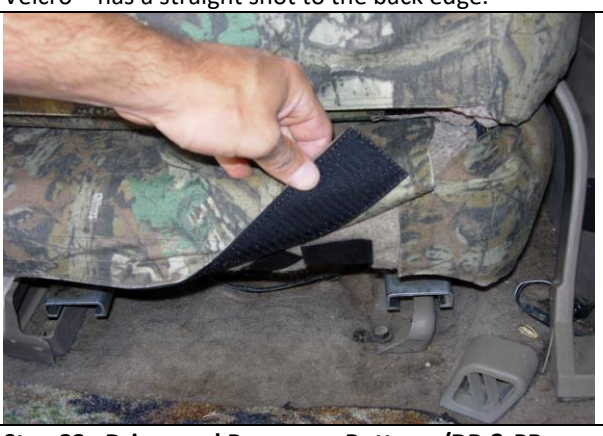
Step 22. Driver and Passenger Bottoms/DB & PB: Pull the rear edge of the cover back and press the hook Velcro™ sewn inside to the carpet on the seat.