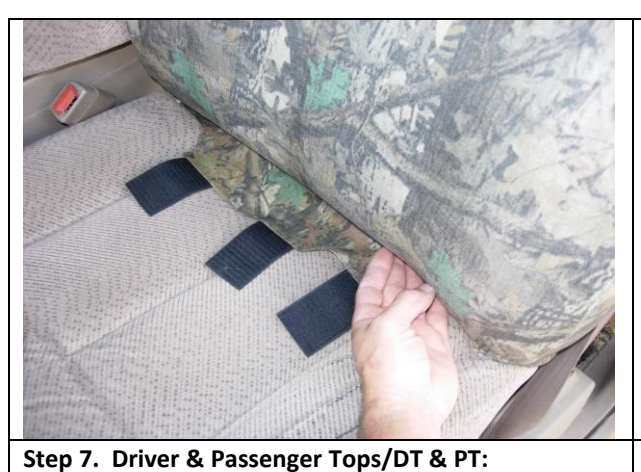
Tuck the hook Velcro™ into the seat, slide the seat all the way forward tipping the backrest ahead. Slide your hand down the front of the seat cover in a

smoothing action from top to bottom while gently pulling on the Velcro™ from behind to tighten it up.