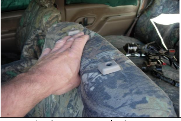
Step 4. Driver & Passenger Tops/DT & PT:

Open the bottom and inside of the seat cover top and slide it on with the extending hook (sticky) Velcro™ to the front.