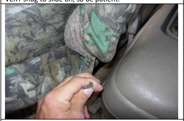
Step 11. Armrests/A:

Working from the backseat area, slide your hands around the top of the armrest and work the cover down, making sure its pulled all the way down.