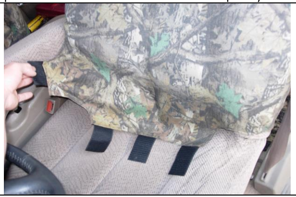
Step 3. Driver & Passenger Tops/DT & PT:

Loosen the screws on the plastic seat control panels, but don't remove them, temporarily remove the recline and access levers from the side of the seat.