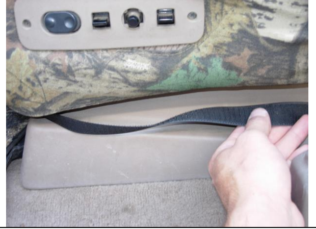
Step 19. Driver and Passenger Bottoms/DB & PB: Route the 1" wide long front hook Velcro™ along the outside edge of the seat and press it to the carpet on the back edge of the seat.

outside edge hook Velcro™ if the seat has manual controls.