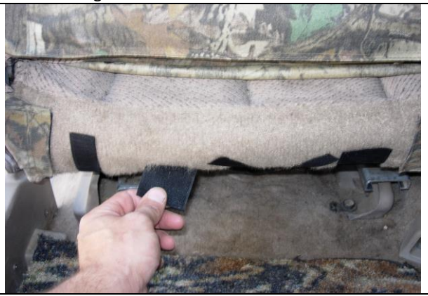
Step 21. Driver and Passenger Bottoms/DB & PB: Pull the long hook Velcro™ back and press them to the carpet as shown.