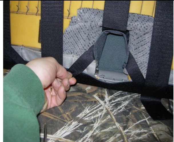
Step 20. Bottom/B: Route the left and right seatbelt Velcro™ at an angle to the loop Velcro™ that's sewn on the back edge of the cover.