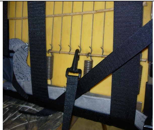
Step 22. Bottom/B: Clip the three plastic Velcro™ buckles where shown, over the metal bar, then press it onto the rear loop Velcro™ on the left, middle and right passenger areas.