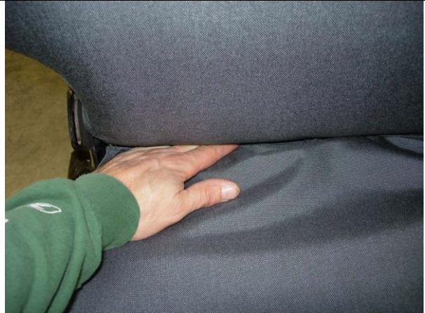
Step 16. Bottom/B: Tuck the back edge in.