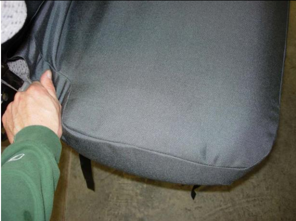
Step 15. Bottom/B: Pull the cover around the back left and right corners.