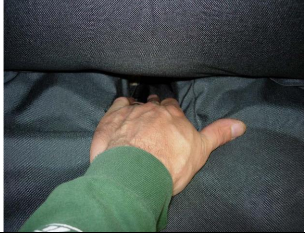
Step 14. Bottom/B: Tuck the seatbelt area into the seat bottom.