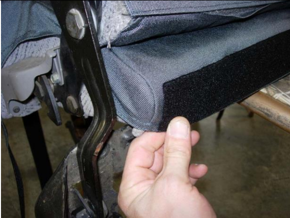
Step 17. Bottom/B: Pull the cover back and around the back corners.