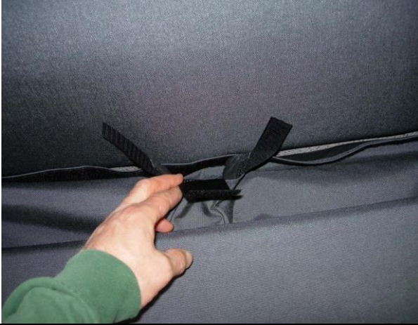
Step 13. Bottom/B: Notice the Velcro™ in the seatbelt area.