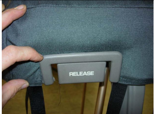
Step 18. Bottom/B: Tuck the cover behind the seat release plastic.