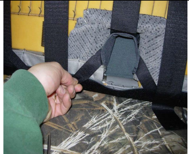
Step 20. Bottom/B: Route the left and right seatbelt Velcro™ at an angle to the loop Velcro™ that's sewn on the back edge of the cover.