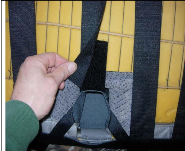
Step 19. Bottom/B: Route the shortest hook Velcro™ from the front to the loop (fuzzy) Velcro™ that's on the front of the seatbelt opening.