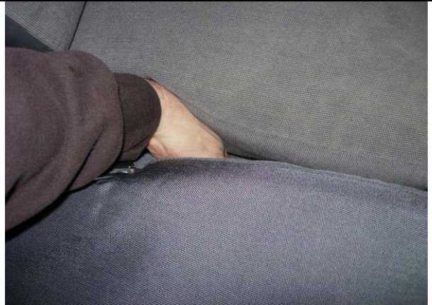
Step 12. Driver & Passenger Bottom/DB&PB: Use your hand to guide the Velcro™ between the seat and seat slide. Carefully feel for it under the seat, and route it back to the back edge. Pull it tight and press it to the loop Velcro™ sewn on the back edge.