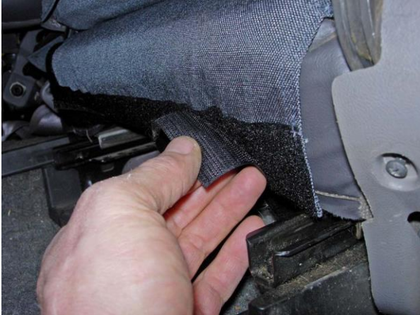
Step 17. Driver & Passenger Bottom/DB&PB: Pull the back edge of the seat cover tight, and press the hook Velcro™ to the loop Velcro™ sewn on the back edge.