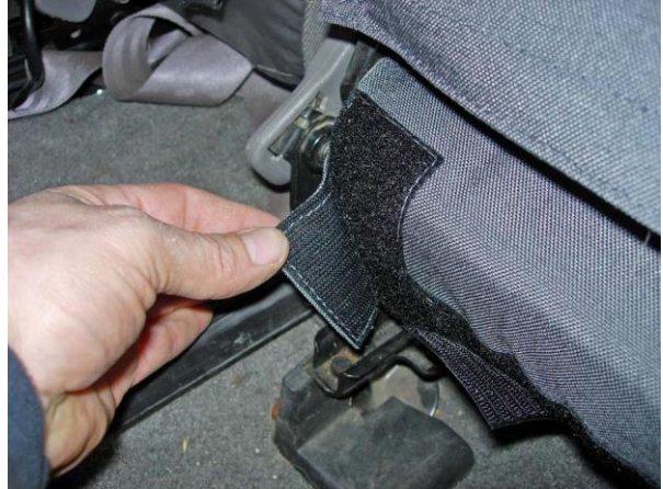
Step 18. Passenger Bottom/PB: Pull the inside edge of the seat cover back and press it to the loop Velcro™ sewn on the back edge.