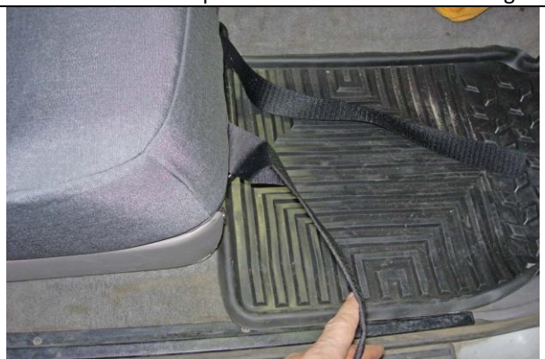
Step 16. Driver & Passenger Bottom/DB&PB: Fold the long front hook Velcro™ in half lengthwise with the sticky facing in. This will stiffen the Velcro™ up and make it easier to route to the back edge.