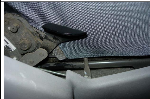
Step 15. Passenger Bottom/PB: Pull the side Velcro™ tight and press it to the loop Velcro™ sewn on the back edge of the seat cover.