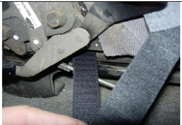
Step 14. Passenger Bottom/PB: Route the outside edge Velcro™ where shown, then carefully feel for it under the seat. Pull it tight and connect it to the loop Velcro™ sewn on the back edge.