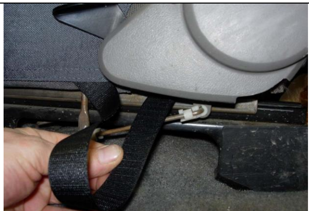
Step 22. Driver Bottom/DB: Route the outside edge hook Velcro™ above the seat slide where shown.