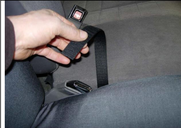
Step 11. Driver & Passenger Bottom/DB&PB: Push the inside edge Velcro™ down between the seats.