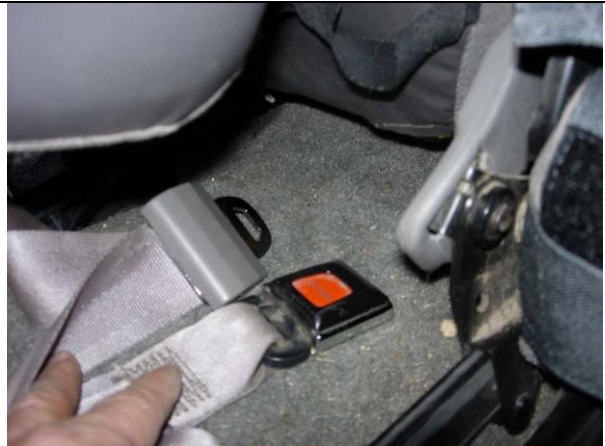
Step 20. Driver Bottom/DB: Remove the seat belts from behind the console from their elastic webbing.