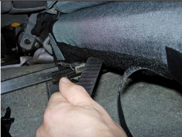
Step 19. Driver & Passenger Bottom/DB&PB: Disconnect the side Velcro™, pull them tight, then re-connect it.