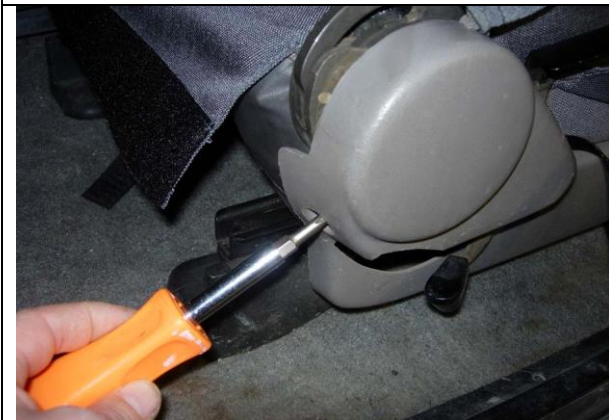
Step 13. Passenger Bottom/PB: Remove the Phillips screws that hold on the plastic cowling and set it aside.