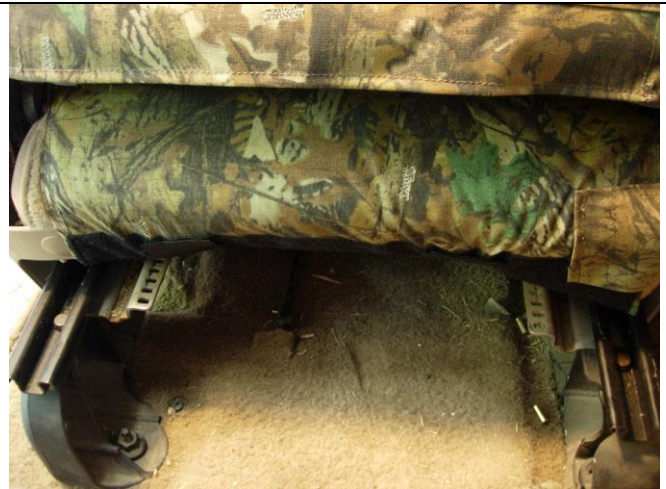
Step 10. Driver and Passenger Bottoms/DB&PB: Pull the inside of the edge of the seat around to the back of the seat and mate it to the carpet on the back edge of the seat. The flap is on the right side of the photo. Route the long inside hook strap around the back inside corner of the seat, mating it to the carpet.