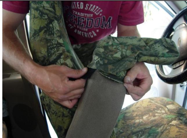
Step 13. Driver and Passenger Armrests/DA&PA: Slide the cover on with the cut out towards the seat.