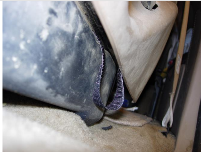
Step 9. Driver and Passenger Bottoms/DB&PB: Route the outside edge hook fastener between the seat slide and the seat as shown and mate it to the carpet on the back edge of the seat.