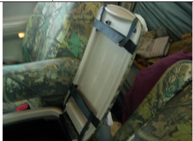
Step 16. Lid/L: Mate the fasteners under the lid as shown. Note: The lid cover was modified and looks different than the picture. The hook fasteners in front extend and mate to the rear fasteners.