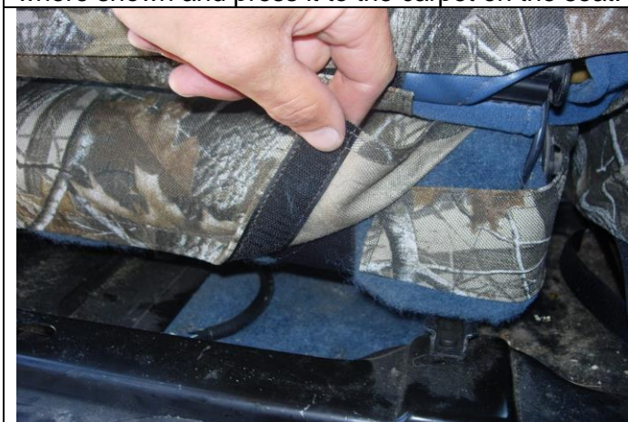
Step 21. Driver & Passenger Bottoms/DB&PB: Lastly, press the Velcro™ sewn inside the back edge by pulling it back and pressing it onto the carpet on the back edge of the seat.