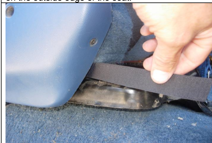
Step 21. Driver & Passenger Bottoms/DB&PB: Route the outside Velcro™ around the back corner where shown and press it to the carpet on the seat.