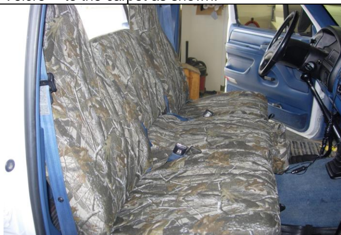
Congratulations, enjoy your seat cover. They take some effort to get on, but once they are installed properly they will stay put and give you several years of use.