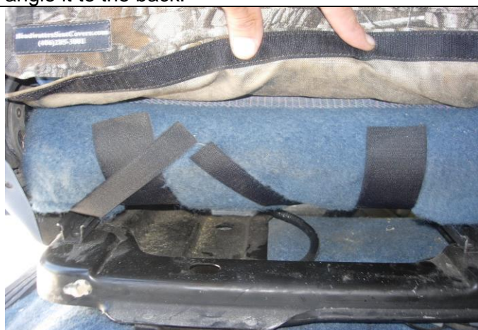
Step 22. Driver & Passenger Bottoms/DB&PB: View from behind the driver seat. Press the Velcro™ to the carpet as shown.