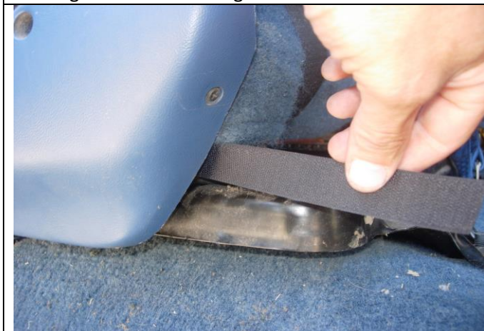
Step 21. Driver & Passenger Bottoms/DB&PB: Route the outside strap around the back corner of the seat where shown and mate it the carpet on the seat.