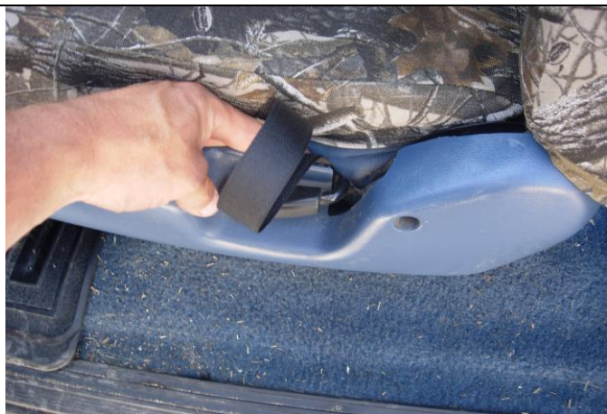
Step 20. Driver & Passenger Bottoms/DB&PB: Tuck the outside edge hook strap behind the recline lever and angle it to the back.