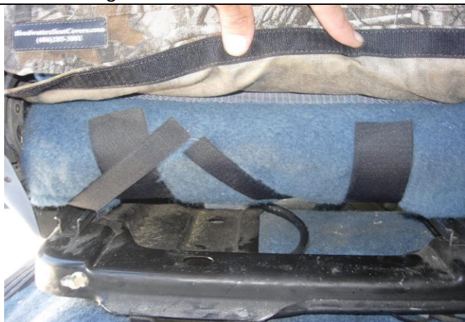
Step 22. Driver & Passenger Bottoms/DB&PB: View from behind the driver seat. Mate the hook fasteners to the carpet as shown.