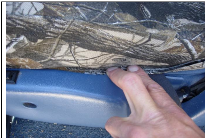
Step 19. Driver & Passenger Bottoms/DB&PB: Tuck the fabric of the seat cover behind the plastic cowl on the outside edge of the seat.