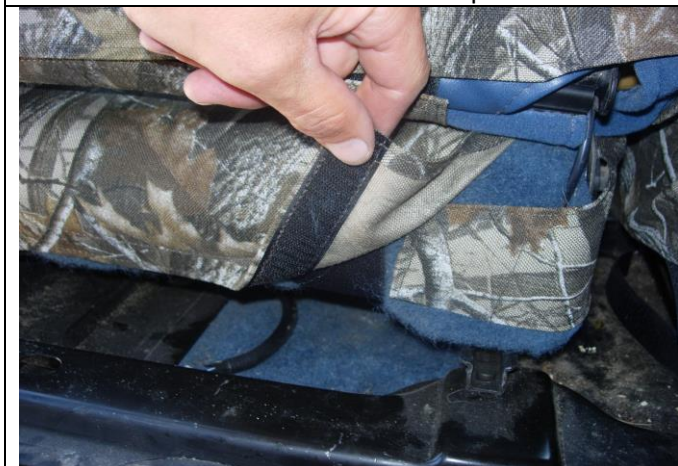
Step 14. Driver & Passenger Bottoms/DB&PB: Lastly, mate the hook fastener sewn inside the back edge by pulling it back and pressing it onto the carpet on the back edge of the seat.