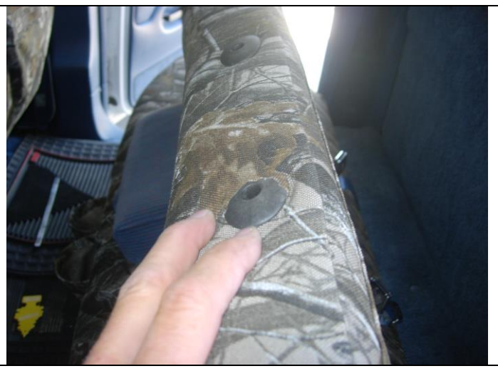
Step 13. Top:

Bolt the backrest to the seat bottom and re-install the plastic covers on both sides.