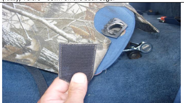
Step 9. Bottom:

Route the hook Velcro™ under the front of the seat, avoiding the seat mechanisms and the slide release wire, connecting them to the carpet on the back edge of the seat, or the loop (fuzzy) Velcro™ sewn on the back edge.