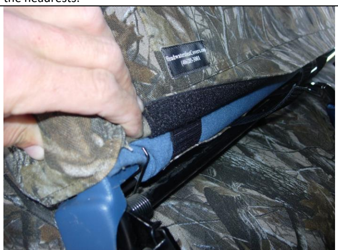
Step 15. Top:

Tuck the hook Velcro™ into the seat, and tip the seat forward.