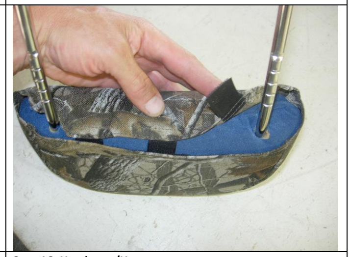
Step 16. Headrests/H:

Route the hook Velcro<sup>TM</sup> between the seat and the wide black metal bar and mate them to the loop Velcro<sup>TM</sup> sewn inside the back edge. Do it by using one hand in a smoothing action down the front of the seat cover, while gently pulling on the Velcro<sup>TM</sup> from the back, then tucking under the back edge and pressing the Velcro<sup>TM</sup> together.