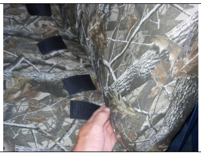
Step 14. Top:

Slide the seat cover on with the extending hook Velcro^{TM} to the front. Tuck the seat cover material under the plastic for the headrests.