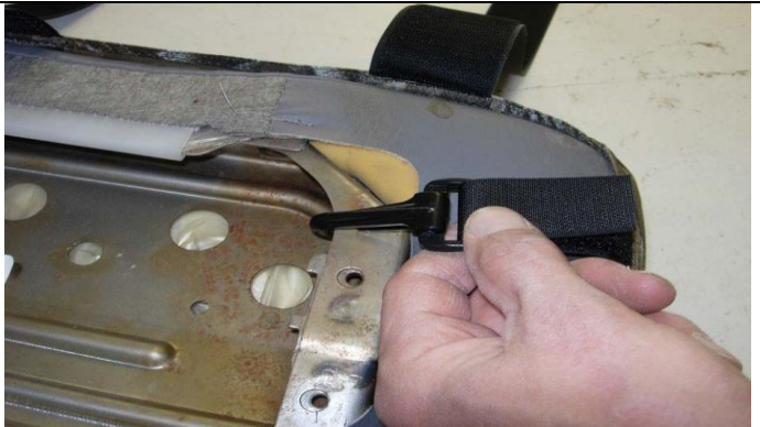
Step 11. Bottom:

Pull the side of the cover around to the back and press it to the loop Velcro^{TM} on the back edge of the seat.