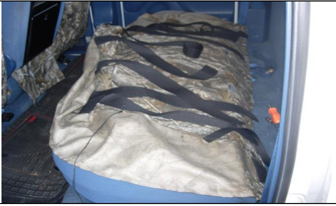
Step 6. Bottom: Place the seat cover on with the long hook (sticky) Velcro ^{\text{TM}} to the front as shown.