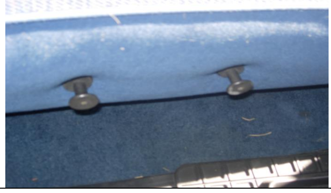
Step 4. Bottom: Temporarily remove the plastic cup holders if it has them, by lifting up. Use a # 25 Torx bit to temporarily remove the bolts. Once the bottom cover is installed, cut a small X where each hole is, and then put the bolts back in.