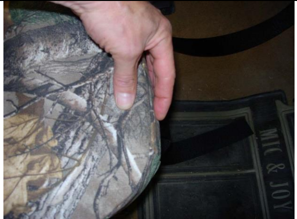
Step 8. Driver & Passenger Bottom/DB&PB: Again, line up the seams of the seat cover to the seams on your seat, they should closely match.