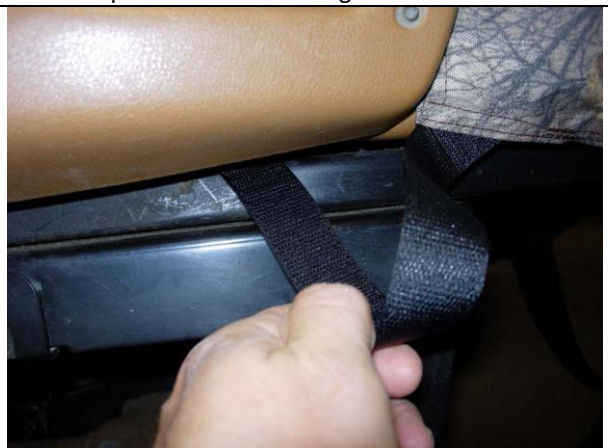
Step 12. Driver & Passenger Bottom/DB&PB: Likewise with the long outside edge hook Velcro™, route it between the seat and seat slide as shown.