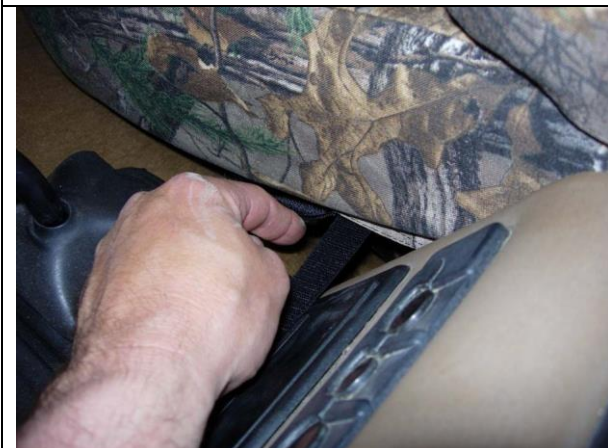
Step 11. Driver & Passenger Bottom/DB&PB: Slide the inside edge hook Velcro™ where shown, between the seat slide and the seat.