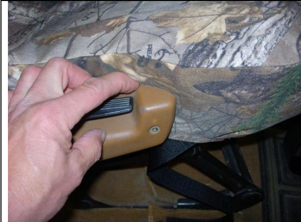
Step 7. Driver & Passenger Bottom/DB&PB: Tuck the seat cover behind the plastic cowling on the outside edge.