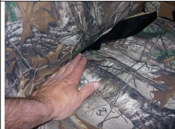
Step 9. Driver & Passenger Bottom/DB&PB: Tuck the back edge in.