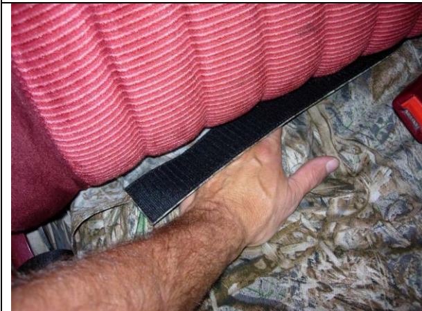
Step 9. Driver & Passenger Bottom/DB&PB: Tuck the back edge into the seat.