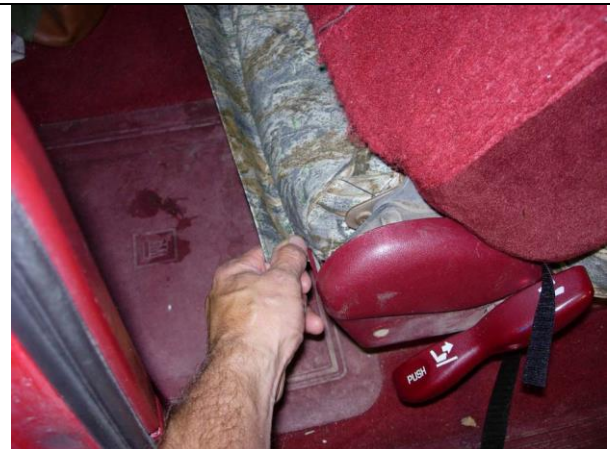
Step 10. Driver & Passenger Bottom/DB&PB: Tip the backrest forward and pull the outside back corner down.