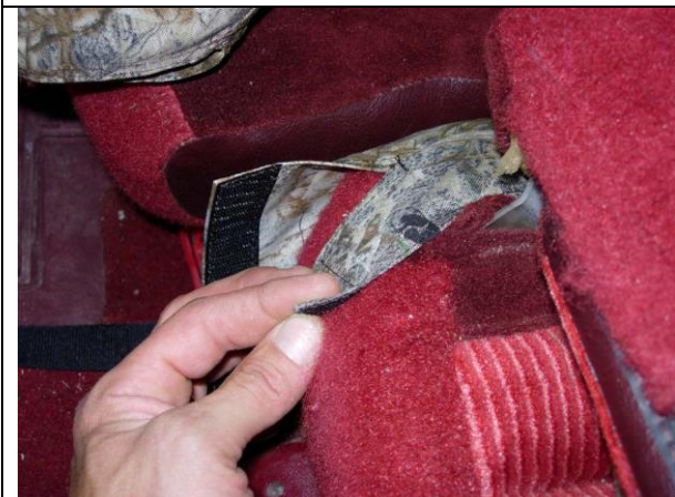
Step 11. Driver & Passenger Bottom/DB&PB: Pull the inside edge of the cover back and stick it to the carpet on the seat.