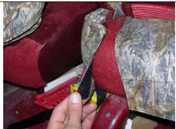
Step 12. Driver & Passenger Bottom/DB&PB: Pull the inside edge of the cover back and stick the Velcro™ to the carpet on the seat.