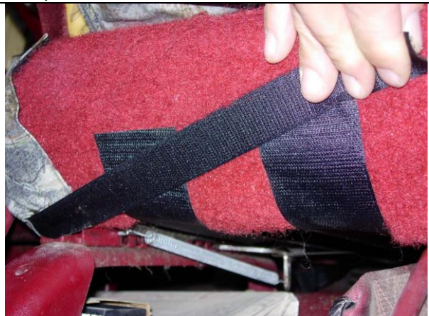
Step 18. Driver & Passenger Bottom/DB&PB: As in Step 17, stick the inside edge Velcro™ to the carpet on the inside edge of the seat.