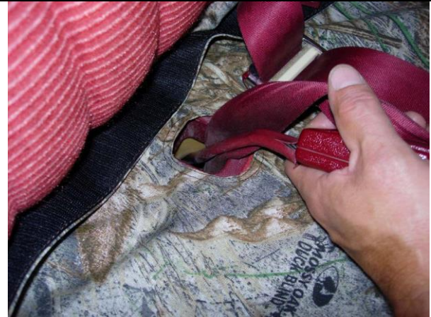
Step 8. Passenger Bottom/PB: Feed the seat belts through the provided opening.