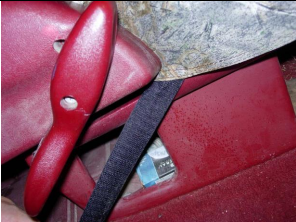
Step 15. Driver & Passenger Bottom/DB&PB: .Tuck the seat cover behind the plastic on the outside edge.