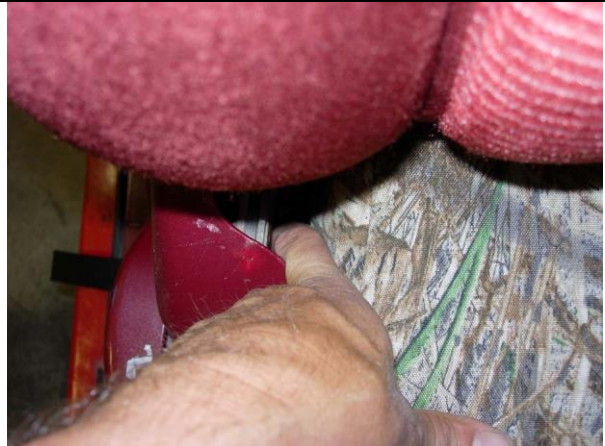
Step 16. Passenger Bottom/PB: Slide the small side Velcro™ straight down through the hole you can see.