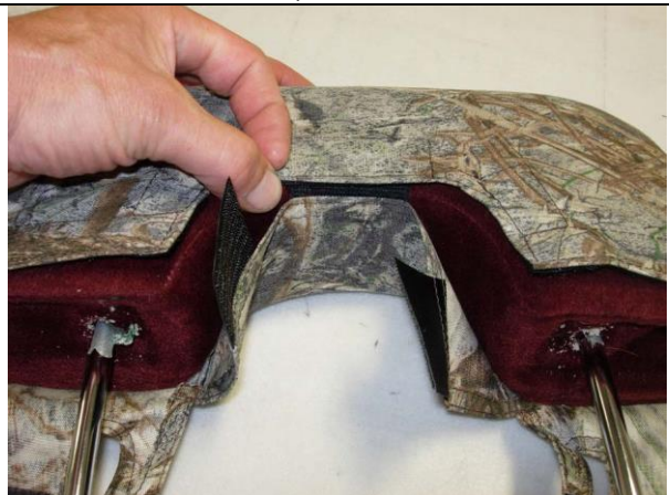
Step 22. Headrests/H: Fasten the center Velcro™ first.