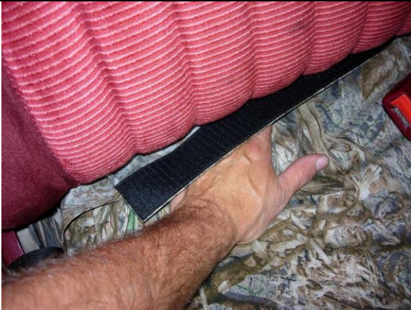
Step 9. Driver & Passenger Bottom/DB&PB: Tuck the back edge into the seat.