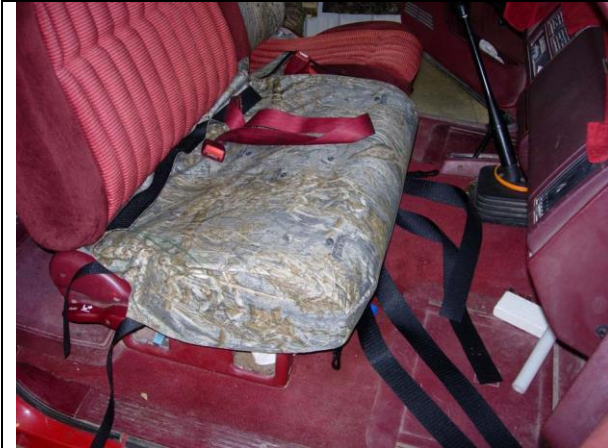
Step 7. Driver & Passenger Bottom/DB&PB: Place the covers on with the extending hook Velcro™ to the front.