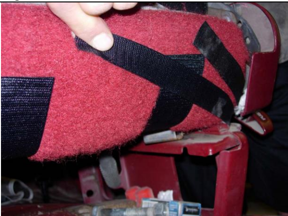
Step 17. Driver & Passenger Bottom/DB&PB: Take both Velcro™ side pieces and stick them to the carpet on the backside of the seat, keeping them about the seat slide in back.