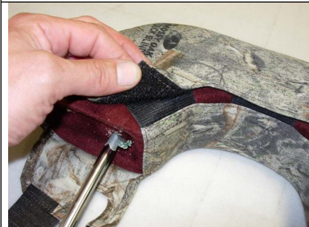
Step 23. Headrests/H: Then do the sides.