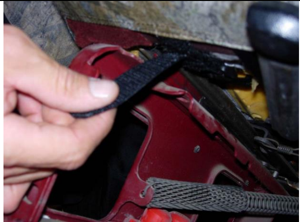
Step 20. Driver & Passenger Bottom/DB&PB: View from under the front of the seat. Snap the plastic buckle over the front of the seat frame, then fasten it back onto itself, trim the excess.