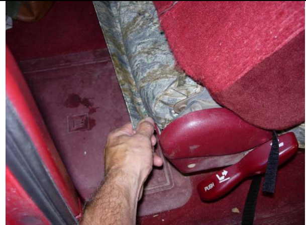
Step 10. Driver & Passenger Bottom/DB&PB: Tip the backrest forward and pull the outside back corner down.