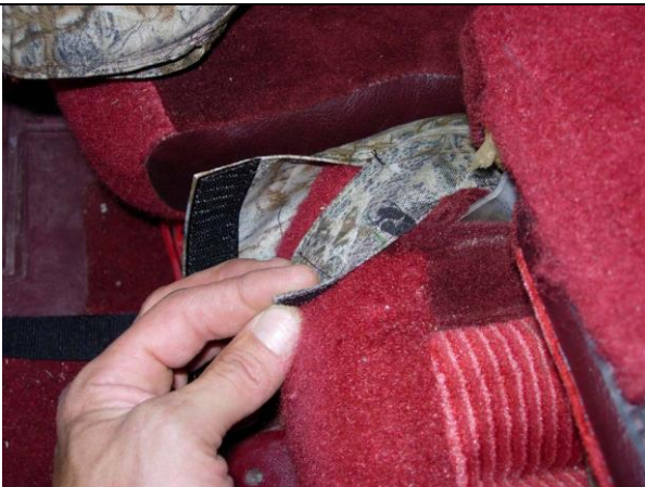
Step 11. Driver & Passenger Bottom/DB&PB: Pull the inside edge of the cover back and stick it to the carpet on the seat.