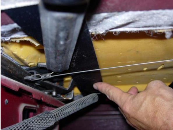
Step 13. Driver & Passenger Bottom/DB&PB: Route the long Velcro™ under the seat, avoiding the seat slide mechanism and wire as shown.