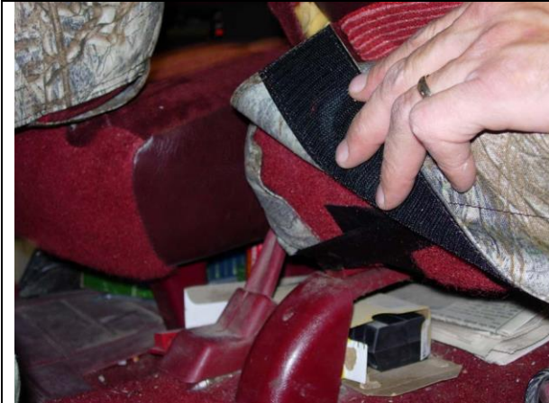
Step 19. Driver & Passenger Bottom/DB&PB: Pull the remaining back part of the cover down and stick it to the carpet on the back of the seat.