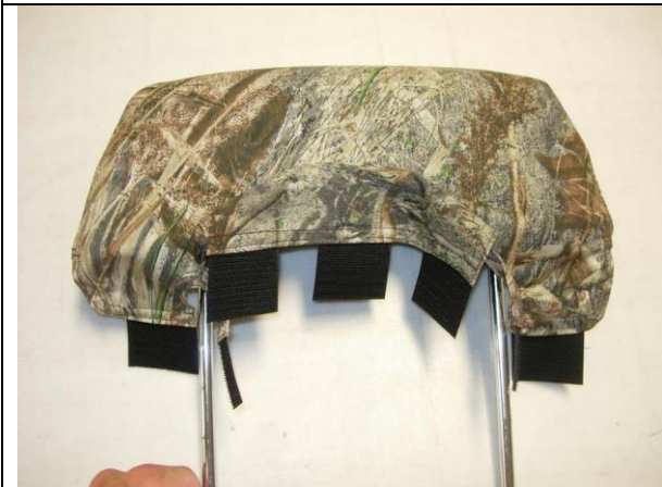
Step 21. Headrests/H: .Slide the cover on with the extending Velcro™ to the front.