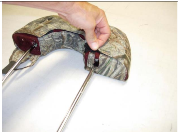
Step 24. Headrests/H: Lastly, do the left and right side, reinstall the headrests back into the seat.