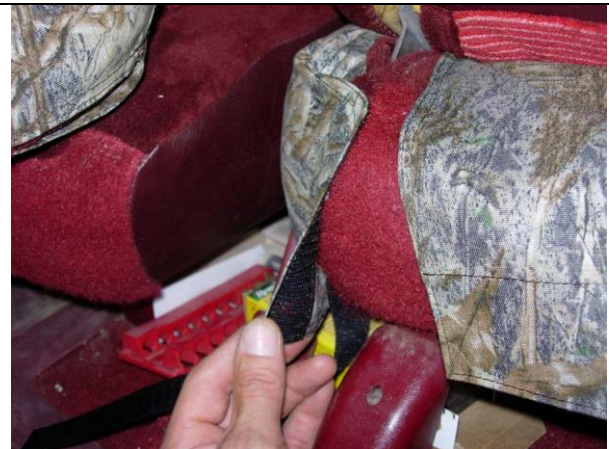
Step 12. Driver & Passenger Bottom/DB&PB: Pull the inside edge of the cover back and stick the Velcro™ to the carpet on the seat.