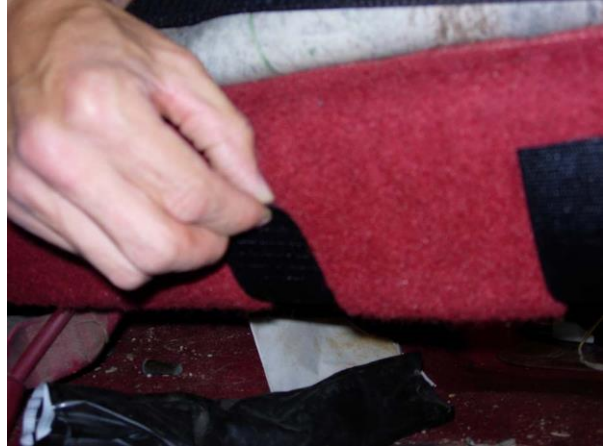
Step 14. Driver & Passenger Bottom/DB&PB: Pull the Velcro™ tight and stick it to the carpet back edge of the seat.