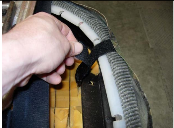
Step 16. Bottom/B: Run the Velcro™ thru the opening on the snap, pull it tight and connect it to itself.