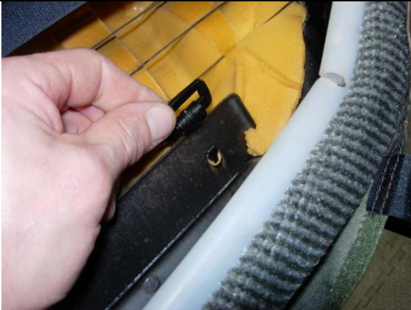
Step 15. Bottom/B: Push it up through the hole in the metal.