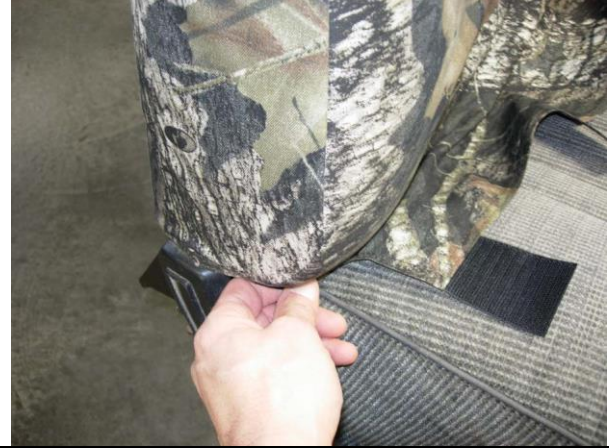
Step 20. Top/T: Pull each side down over the front corners.