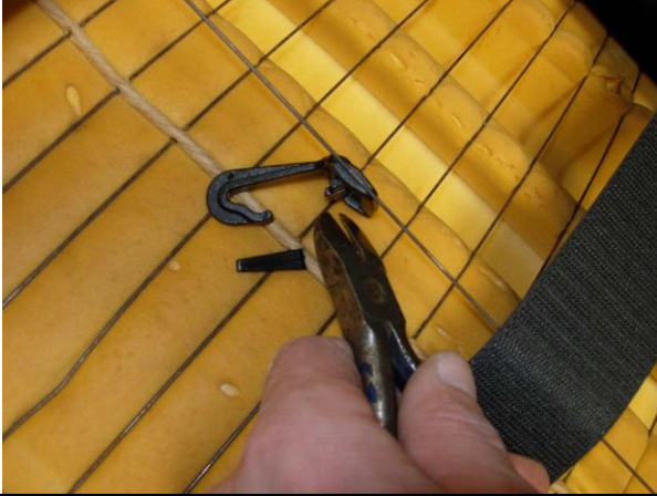
Step 13. Bottom/B: If the plastic hook is not prepped and still has the retainer on it, clip it off with a side cutter.