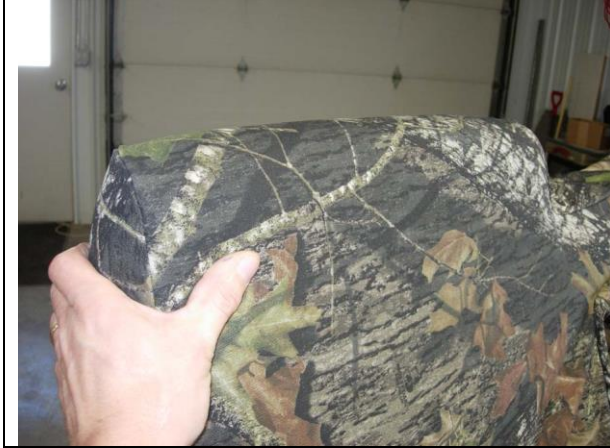
Step 19. Top/T: Form the seat cover to the top of the seat.