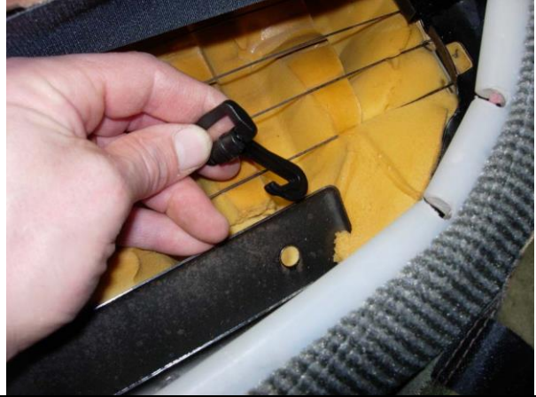
Step 14. Bottom/B: Force the clip under the metal plate.