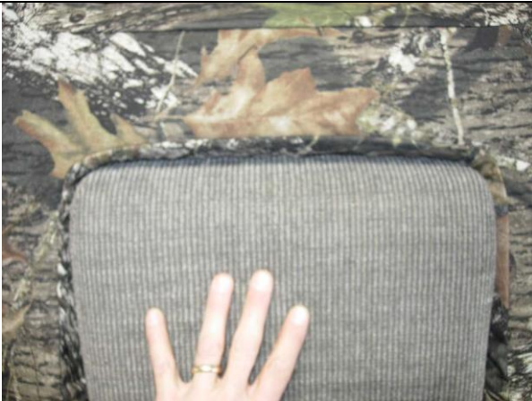
Step 23. Top/T: Push the armrest back into the cavity.