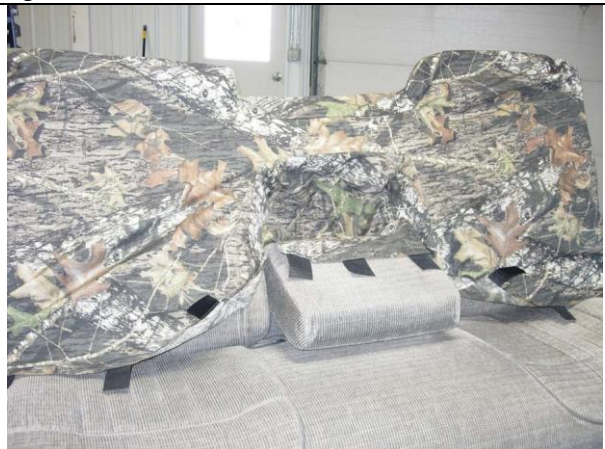
Step 18. Top/T: Bolt the seat top to the bottom and put the plastic covers back on the sides. Fold the armrest down, sliding the seat cover on with the extending hook Velcro™ to the front.