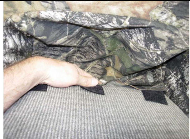
Step 22. Top/T: Tuck the material behind the armrest.