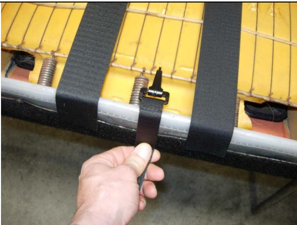
Step 17. Bottom/B: Connect the three back edge plastic buckles to the metal bar where shown, then press them onto the loop Velcro™