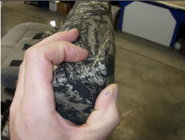
Step 21. Top/T: As in Step 5 & 7, line up the seat cover to the seams on the seat.