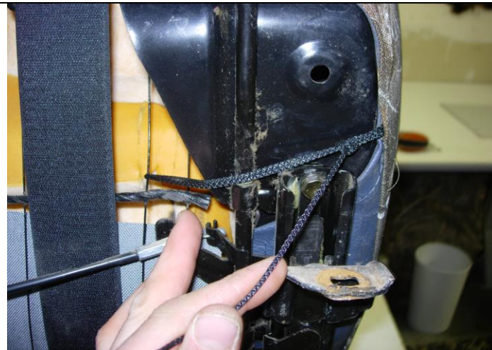
Step 7. Bottom: Route the side ropes under the seat to a support wire as shown and tie back to the loop where the rope was sewn on. If you feel the edge of the metal is sharp where the rope comes across it, slide a short piece of plastic tubing over the rope to protect it from being cut.