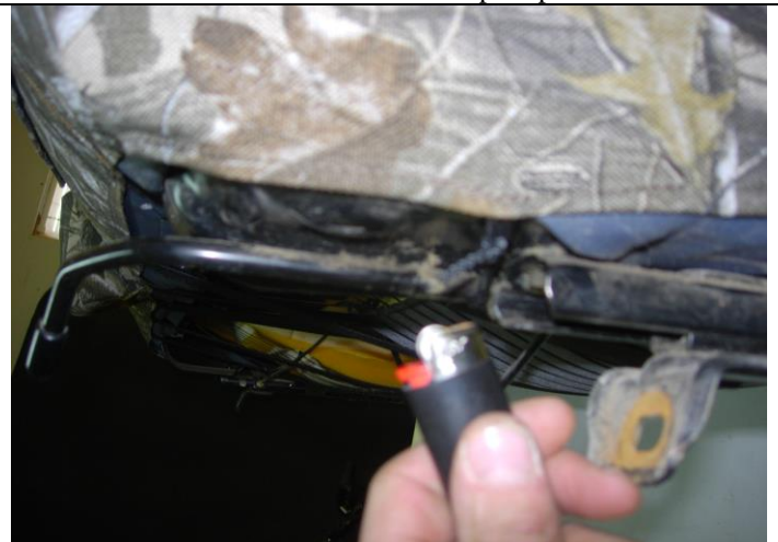
Step 8. Bottom: Cut off the excess rope and carefully singe the cut. Do this by heating the cut up with a lighter and blow it out as soon as it flames up. This will keep the rope from unraveling if the seat cover is washed and re-installed.