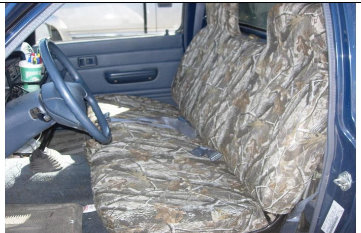
Congratulations, you are done! Your seat covers will stay in place and are ready for any abuse you can dish out. Pictured is Realtree Hardwoods™ HD 1000 Denier Cordura. They fit like they are painted on.