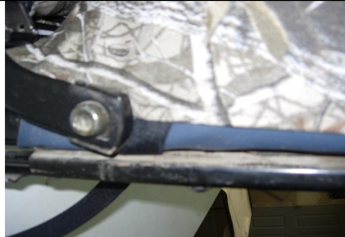
Step 5. Bottom: Slide the long front outside edge hook straps in between the seat and the seat slide as shown.