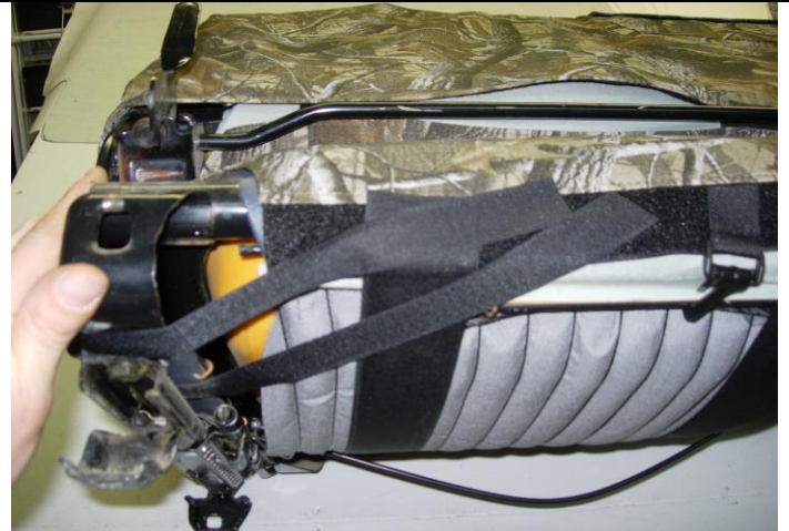
Step 6. Bottom: Tuck the long rear outside edge hook strap behind the metal bar that tilts the backrest forward and behind the seat slide. Mate them to the rear loop strip as shown.