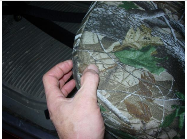
Step 8. Bottom/B Work the fabric inside the seat cover seam outward, or from thumb to forefinger.