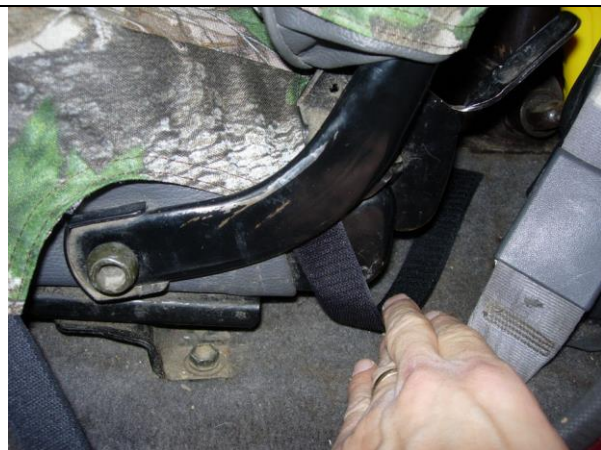
Step 11. Bottom/B Route the rear most side hook fastener behind the hinge arm and route it around the back corner.