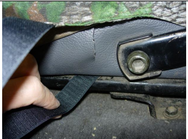
Step 10. Bottom/B Route the hook fastener between the seat slide and the seat, just in front of the hinge arm.