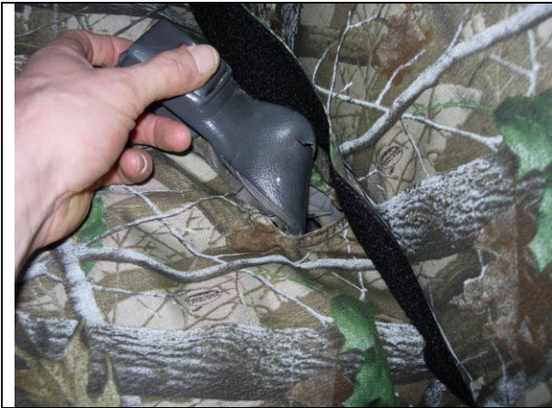
Step 7. Bottom/B Feed the seat belts through the provided openings.