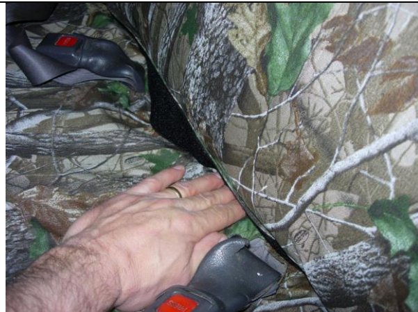
Step 9. Bottom/B Tuck the back edge in.